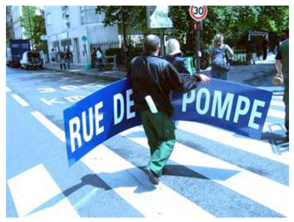
Figure 6. Carrying a board.

Finally, a simple look at the subway signs during work processes allows the understanding of a very simple fact: signs that may be considered as texts, connected entities, deictics or landmarks are also objects. Installation is made by handling activities: workers have to carry boards, put them up on walls, take them down, and so on (Figure 6). Dealing with materiality is thus a crucial way for workers to treat subway signs.