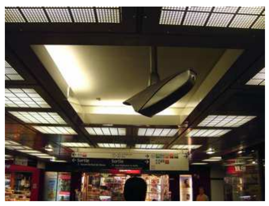
Figure 9. The board, among other objects.

too short. Some tall passengers may hurt themselves.' Leonard turns around, looks up again and adds right away: 'and the board would be hidden by this video camera. Besides it may hide information given on the existing board' (Figure 9).