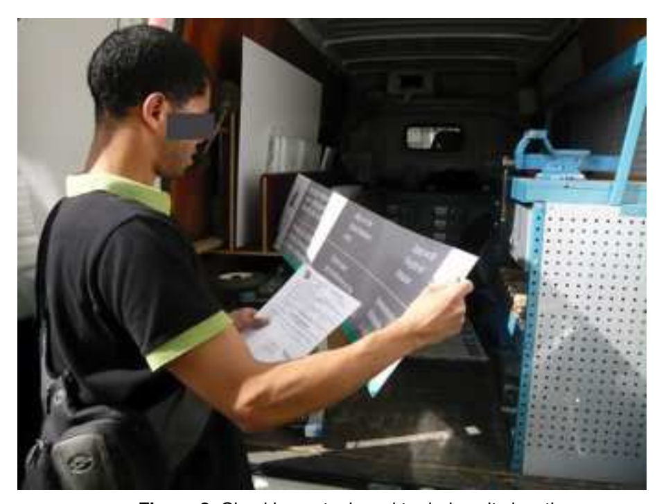
Figure 3 . Checking out a board to deduce its location.

Nathan and Stephan are on their way to replace a board in a very large station that has to be placed at the top of the entrance stairs. They drive around the square above the station, looking for the right entrance. There are a lot of entrances and they stop the van each time to check if the entrance has the same identification code as the one that figures on the WO. But after they have driven around the entire square and looked at six entrances, they still have not found the right one. Stephan decides to change their tactics. He goes to the back of the van and looks at the board itself. He reads its information and the ones on the WO in order to understand where they have to put up the board (Figure 3).