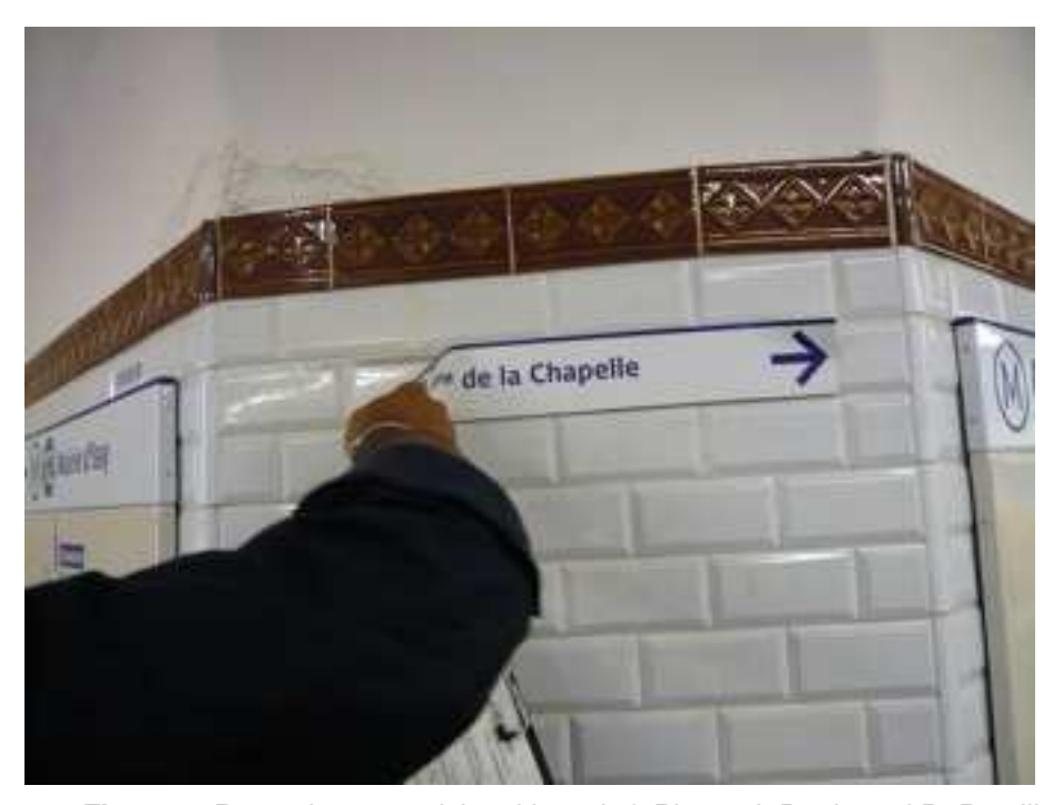
Figure 1. Removing a provisional board.

more reason to be here. I don't have to replace it'. In saying this, he pulls off the provisional sign (Figure 1).