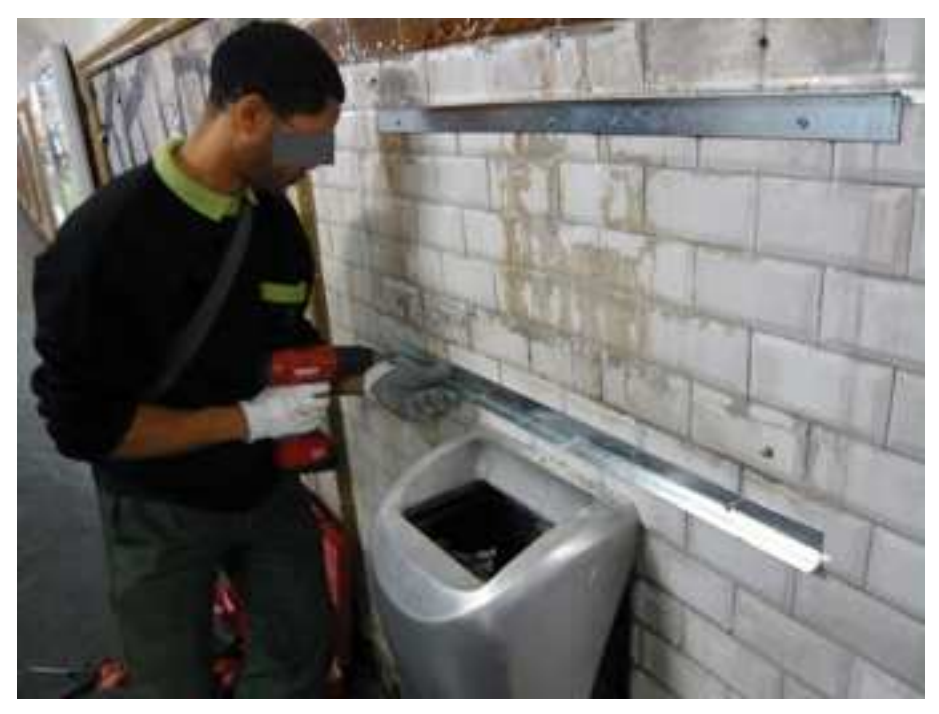
Figure 7. Drilling.

scribble a few marks on the wall. They use the tiles as a guide to make sure the new board will be positioned straight. For these operations they use two different drills, glue cement, a pen, a measuring tape, a screwdriver, plugs and screws (Figure 7). Once the board is put up on the wall, Stephan carefully wipes it and says: 'Here it is, a brand new sign.'