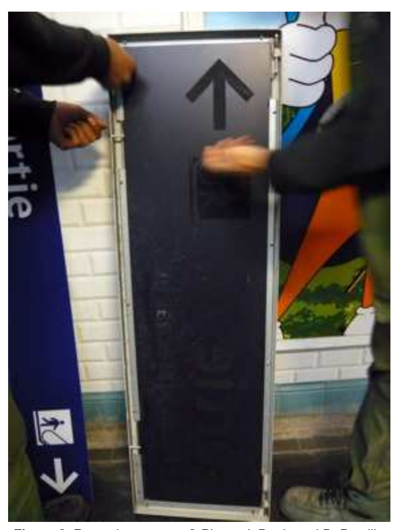
Figure 8. Removing screws.

Workers' practices depend largely on designers and manufacturers who do not necessarily take their activities into account when they make brackets or frames. When they consider boards as objects, workers are confronted with a material assemblage that is the result of activities prior to their own. In these cases, they handle signs as stabilized entities whose materiality is a particularly resistant feature in the completion of their work.