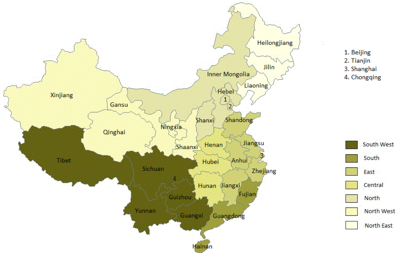
Figure D.1: Seven areas of China