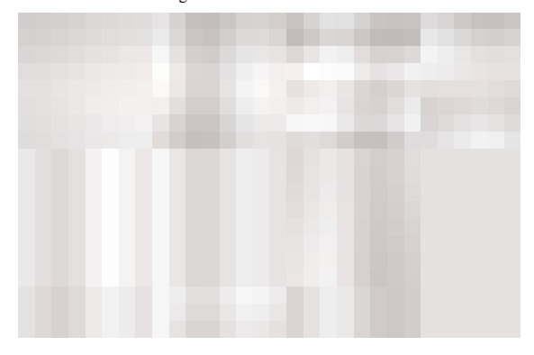
Table 1. Main Mega and Multifunctional Master Projects Announced in Damascus and Surrounding Areas

First there are the larger investments. No less than six projects (Eighth Gate, Khams Shammat, Internet City, Damascus Financial District, Damascus Hills, Diar Damascus) have an announced investment of between $1 and $4 billion each, which is comparable to planned investments for the big projects in other cities around the Mediterranean. In particular, commercial space is always at a higher volume. Previously a nonexistent concept in the city, six malls - 150,000 m<sub>2</sub> - opened in Damascus between 2002 and 2009 and at least fourteen others with a total area of 820,000 m<sup>2</sup> have been announced. Three of the larger projects include malls with an area over 100,000 m<sup>2</sup>: Eighth Gate and Khams Shammat in Yaafour and Concord Commercial Complex on the highway to Jordan. These large developments can be the motors for the spatial restructuring of the metropolis. Most of them, announced in 2005 and 2006, are located in the northwestern extension of the city (Eighth Gate, Khams Shammat, Damascus Financial District, and Damascus Hills). The isolated case of the Damascus Diar Development, announced in 2008, plans urban renewal of a large area in central Damascus.