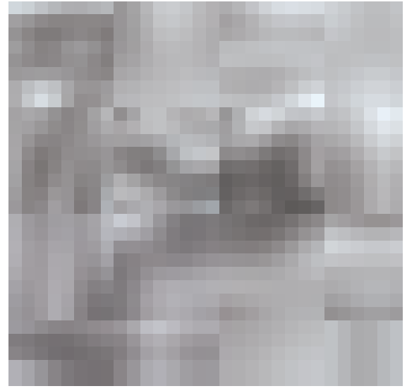
Figure 3. Location of announced development projects in and around Damascus

of buildings on 10 hectares to develop a dense urban space with a new mall, towers, several office buildings, high-rise hotels, and in this case, housing spread out over approximately a third of the land. These projects contribute to the density and compactness of the city. They favour vertical height as in the Abraj Souria project (two 63-storey towers), the Diar Damascus project (four towers), and other tower projects in preparation downtown. These developments emerged in parallel and before the execution of the new Master Plan for Damascus, which has to allow the distribution of property investments to strategic areas. Some seventeen areas of urban renewal are already decided, for example, on the outskirts of the old city (Malek Faycal Street) or on the perimeter of the sustainable neighbourhood project, called 'West of 30th Street', developed with European cooperation. Today we see the contrary: master investment projects in progress, located contingent on property opportunities, and for which the decision is made in higher places and not only with the administrations responsible for the town planning. Integrated in the Master Plan at the study stage, these projects pre-define the resulting modification of urban form (district plan, forms and height of the buildings) of numerous spaces in the city.