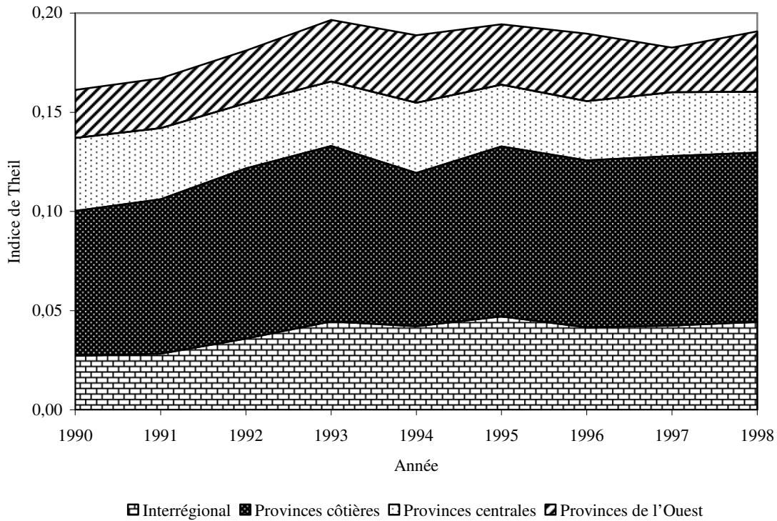
Figure 1 - Decomposition of the Theil Index : Real GDP per capita