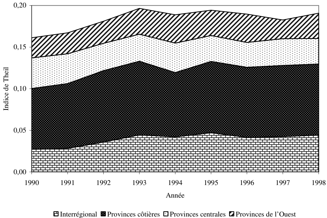
Figure 1 - Decomposition of the Theil Index : Real GDP per capita