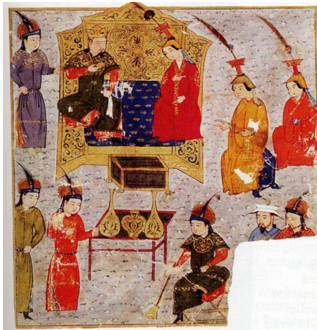
Fig. 16. Tolui and his court, Jami 'al-tavarikh , 14 th century, by Rashīd ad-Dīn, Ms Sup persan 1113, folio 164v, Bnf, Paris.

In Qing dynasty Mongol paintings of the universal monarch ( cakravartin )'s Seven Jewels, the queen and the minister are depicted on an equal footing, on the right and left (or left and right) of the wish granting jewel and the cakra , a disposition which is not seen in Tibetan painting. 64 Even when the universal monarch himself is not depicted, the symmetrical arrangement of the queen and the minister is an obvious reference to the enthroned royal couple.