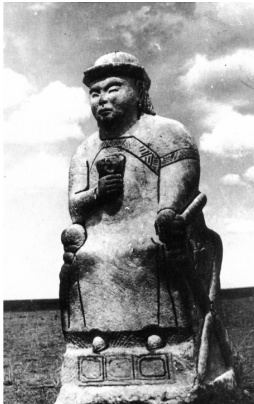
Fig. 1. Stone marble statue, 13 th century, Sühbaatar province, Dariganga sum. Tsultem 1989: n°56.

rosary in their left hand, others hold the cup with both hands. Their face generally looks towards the southeast. Their clothes and hats are comparable to those of Yuan tomb mural paintings' figures such as that of Yuanbaoshan 元寶山 (fig. 18), to real robes and hats found in tombs, and also fit with the section on costume in the official Yuan History : 6 male robes fastened to the right, sleeves tight-fitting at the wrist, belt from which are suspended personal accessories, boots, caps or turbans. 7 The majority of them are sitting on a folding chair ( jiaoyi 交椅) with a round back, armrests, and feet-support.