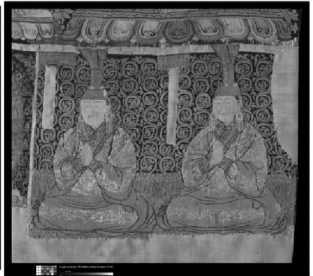
Fig. 6A. Detail: two emperors, TuγTemür and his elder brother Qosila , on the lower left of the thangka...