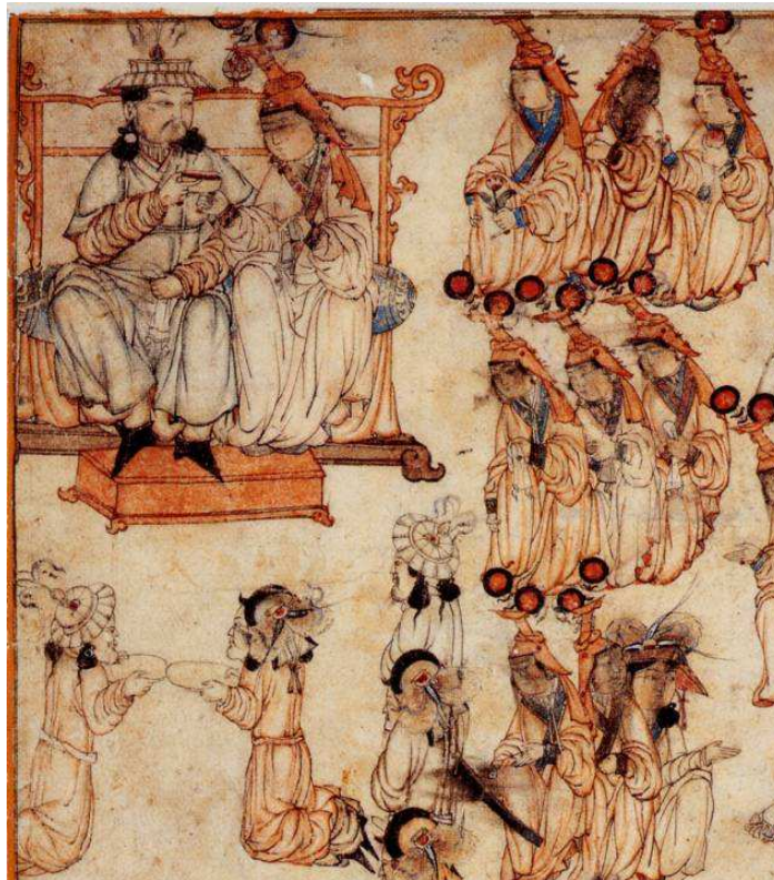
Fig. 15. Enthronement scene depicting the ruler and his consort surrounded by members of the court, detail, Jami 'al-tavarikh by Rashīd ad-Dīn, illustration from the Diez Albums , ink, colors and gold on paper, Iran (possibly Tabriz), early 14 th century, Staatsbibliothek zu Berlin – Preussischer Kulturbesitz, Orientabteilung (Diez A fol. 70, S. 10).

The Mongols made eclectic choices when representing their rulers, borrowing themes from the Chinese, Turkic, Uyighur and other traditions, and rejecting others. A major difference with previous Inner Asian portraits of kings in regalia is that in paintings the Mongol ruler is often depicted with his main wife (fig. 9, 11, 14, 19). 63 The qatun is the same size and sits on an equal footing with the qan . A similar arrangement, found in Ilkhanid manuscript paintings, shows the enthroned king with his queen in an open air courtly reception, especially in the Jami 'al-tavarikh (Compendium of chronicles) by Rashīd ad-Dīn, painted in the early 14 th century (fig. 15 and 16) – it is particularly noteworthy that when books from the same milieu (e. g. the Great Mongol Shahnama , the Book of Kings) represented the ancient kings of the past, pre-Mongol conventions were followed.