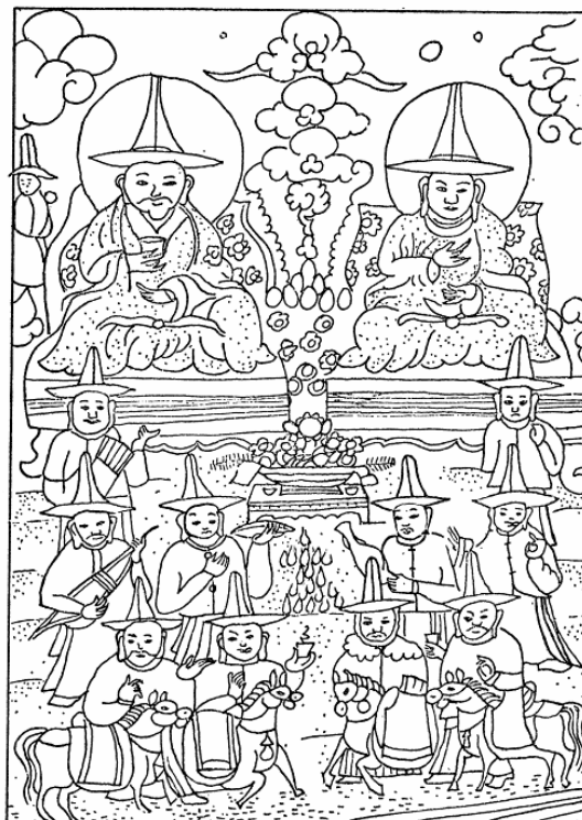
Fig. 14. Sacrificial image, representing Chinggis Khan, his main consort and his sons. Copy of a 'Yuan dynasty painting' preserved in the 'mausoleum of Chinggis Khan,' Ejen Qoriya banner, Ordos (probably Qing dynasty). Drawing from Heissig 1973 [1970]: 421, fig. 11 (from Dylykov, S. D., Edzen-choro , Moscow: Filologija i istorija mongol'skich narodov , 1959; see a reproduction in Solongγod 1999: fig. 13). The cup of the qatun has been omitted in the drawing but is present on the painting