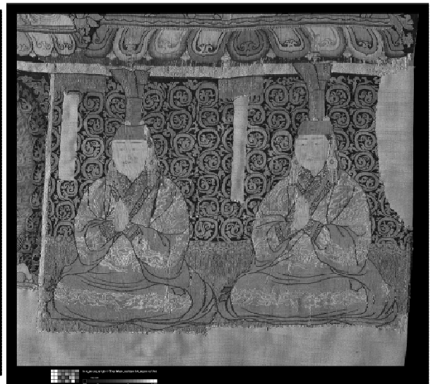
Fig. 6A. Detail: two emperors, Tuγ Temür and his elder brother Qosila, on the lower left of the thangka...