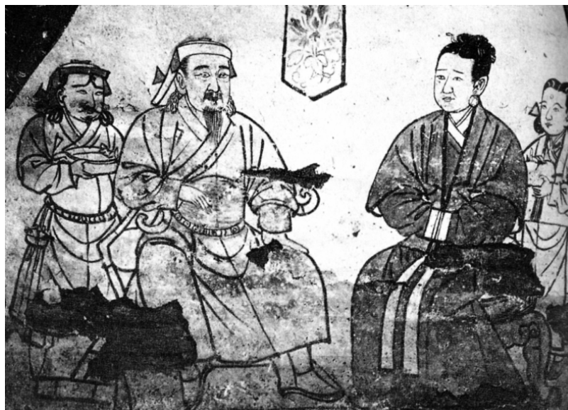
Fig. 18. Painting of the tomb occupants, detail, Yuanbaoshan tomb, north wall (width 2,43m, height 0,94m), Chifeng municipality. From Xiang Chunsong, 1983, color pl. 1.