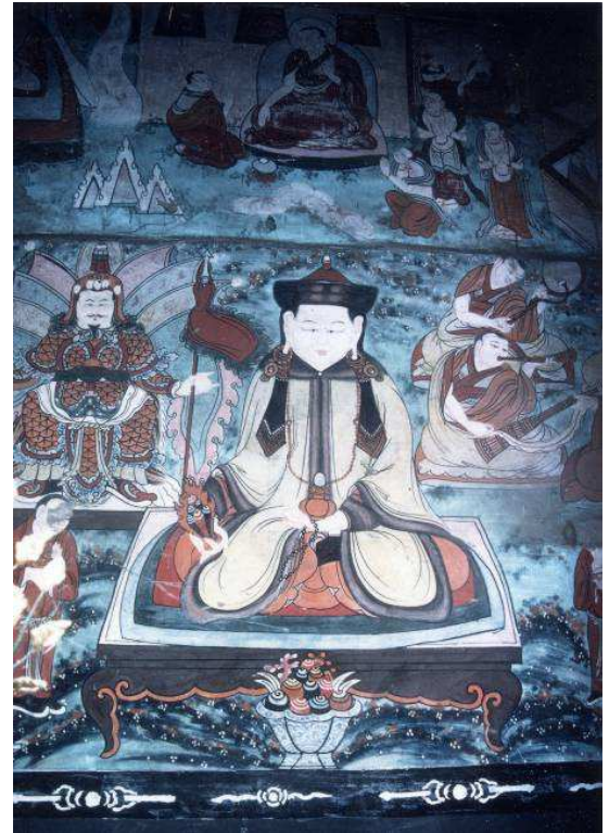
Fig. 8A. Cürüke (Altan Qan's grandson and Jönggen Qatun third husband), detail of the right part of the donors' painting (see fig. 7).