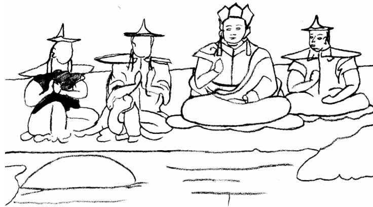
Fig. 10. Drawing of the painting of donors, detail, south wall, lower register (120x50cm), right to the entrance, cave n°28 at Arjai (Otoy banner, Ordos). © Isabelle Charleux

In cave 28, a painting (120x50cm) allegedly representing Chinggis Khan's family caused much ink to flow ( fig. 10 ). A procession of a hundred people worship eight persons sitting on a large white platform under a dark tent or an architectural monument, in front of a table covered with offerings. Although there is no inscription, the archaeologists believe that the painting of cave 28 is a Yuan dynasty 'imperial portraiture' ( yurong ) for the sacrificial rites, and agree to identify the main characters as Chinggis Khan, surrounded by his main wife Börte Üjin (on his right) and his other two wives Qulan and Yisügen (on his left); farther on his left would be sitting his four sons (Joci, Cayadai, Ögedei, and Tolui); and the worshipping figure sitting below on the left and leading people offering camels and horses would be his fourth wife, Yisüi. 53