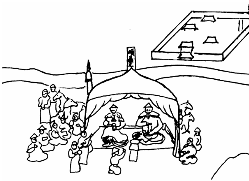
Fig. 19. Altan Qan and his wife, drawing of the painting which accompanied a letter written on a horizontal scroll, dated August 17, 1580, addressed to the Ming emperor. Institute of Eastern studies, attached to the Russian Academy of Sciences, St. Petersburg (from Pozdneev, 1895).

The reverse, seen in two tomb murals (Beiyukou and Sanyanjing), seems to be an 'anomaly,' probably a Chinese influence. In a unique political document dated 1580 depicting Altan Qan and his wife, the qatun sits on the qan 's right ( fig. 19 ). 67 In this case, the switched position might have been intended to fit with Chinese customs, and to please the Ming emperor to whom it was destined. Or else, the letter was rewritten and redrawn by the Ming officials in order to present a formatted document to satisfy the requirements of the Ming court, a usual practice for this kind of document. Except for this detail, the representation of the qan and his wife remarkably fits with the Mongol conventions: they sit cross-legged under a yurt, holding rosaries, and receive offerings from kneeling courtiers and servants. The qatun , probably Jönggen Qatun, is slightly smaller than Altan Qan.