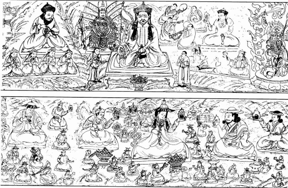
Fig. 7. Mural painting representing Buddhist lay donors and monks of Altan Qan's family, main temple of Mayidari-yin Juu, lower part of the western wall of the back shrine, H. 2m, L. 16m long, 17 th century (drawing by Wang Leiyi, in Jin Shen 1980: 176).

Temples preserving two-dimensional portraits of Mongol qan are known after the fall of the Yuan dynasty. The fortified Mayidari monastery (Mayidari-yin Juu, Ch. Meidai zhao 美岱召), 70km west of Hohhot (Kökeqota), preserves in the rear part of its main temple a large 17 th century mural painting 49 of donors where the Chinggisid nobility is represented below a 7-meter high painting of Tsongkhapa (Charleux 1999) ( fig. 7 ). The painting represents the two princesses who patronized this monastery – one of the oldest of the Buddhist revival: on the right side on Tsongkhapa's throne, Jönggen Qatun (known in Chinese as Sanniangzi), Altan Qan's famous Third wife (ca. 1550-1612) faces her third husband Cürüke, who bends towards her in a respectful attitude ( fig. 8A, 8B ). 50 On the other side of the painting, the princess Maciy Qatun (ca. 1546-1625) faces the Mayidari Qutuytu (1592-1635), a Tibetan reincarnation recognized as an emanation of Maitreya and sent to Hohhot in 1604. Fifty-eight laymen and monks of much smaller size, turned towards the central characters, most of them sitting in padmāsana in a worshipping attitude and two divinities complete the scene. The painting is laden with Buddhist symbols such as piles of jewels, the Eight auspicious symbols, etc.