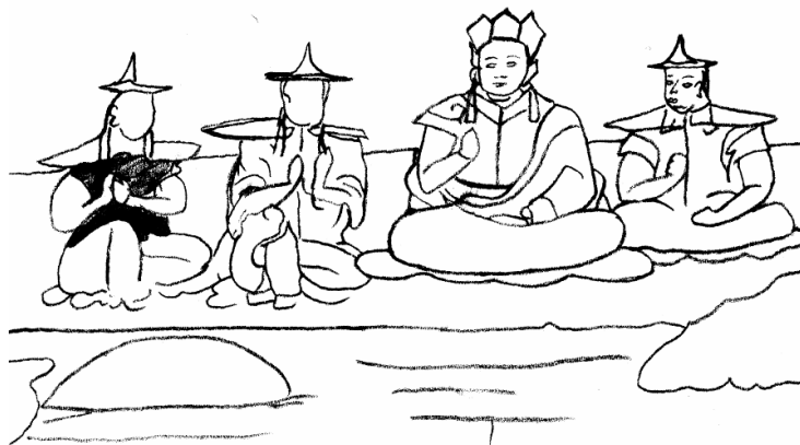
Fig. 10. Drawing of the painting of donors, detail, south wall, lower register (120x50cm), right to the entrance, cave n°28 at Arjai (Otoy banner, Ordos).

In cave 28, a painting (120x50cm) allegedly representing Chinggis Khan's family caused much ink to flow ( fig. 10 ). A procession of a hundred people worship eight persons sitting on a large white platform under a dark tent or an architectural monument, in front of a table covered with offerings. Although there is no inscription, the archaeologists believe that the painting of cave 28 is a Yuan dynasty 'imperial portraiture' ( yurong ) for the sacrificial rites, and agree to identify the main characters as Chinggis Khan, surrounded by his main wife Börte Üjin (on his right) and his other two wives Qulan and Yisügen (on his left); farther on his left would be sitting his four sons (Joci, Cayadai, Ögedei, and Tolui); and the worshipping figure sitting below on the left and leading people offering camels and horses would be his fourth wife, Yisüi. 53