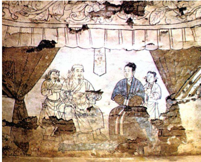
Fig. 17. Portrait of the tomb couple on the north wall, Pucheng tomb, Donger village, Pucheng district, Shaanxi province, northeast of Xi'an, 1269 (Liu Hengwu 2000; Shaanxi sheng kaogu yanjiusuo 2000)

couples, or Mongols who chose to be depicted in the Chinese fashion, with Chinese furniture and vessels. The other elements in these portraits, such as the architectures, screens, back curtain, and tables rendering the domestic atmosphere, are not seen in sovereign's ancestors' statues and paintings, and are proper to the genre of Chinese tomb paintings. They show that the tomb occupants have a comfortable life, surrounded by servitors. 66