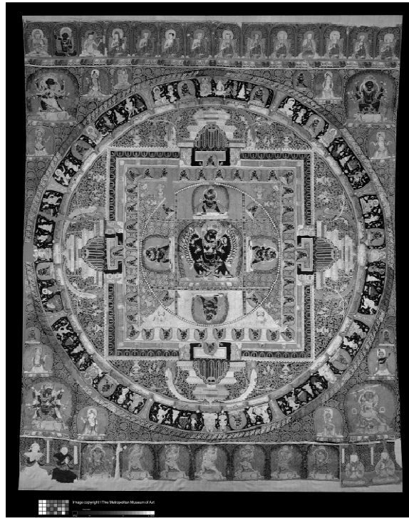
Fig. 5. Mandala of Vajrabhairava, silk tapestry ( kesi ), 246,1x208,3cm, China, ca. 1328-1329 or after 1332, Metropolitan Museum of Art of New York (Purchase, Lila Acheson Wallace Gift, 1992 (1992.54).

of a large imperial monastery: 2,5m high woven portraits of deceased emperors and empresses were hung together with woven mandalas of the same size (to the left and right of the portraits) and their name tablets were placed on an altar.