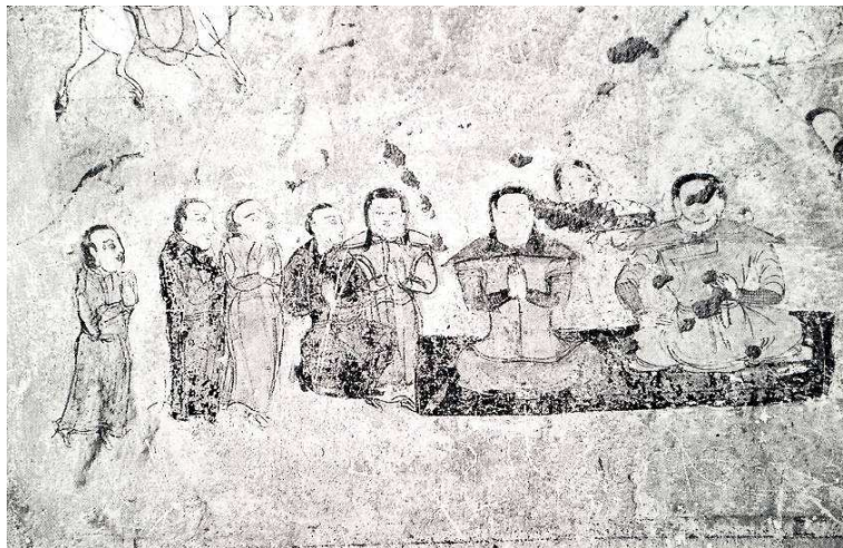
Fig. 11. Painting of donors, south wall, lower register, left to the entrance, cave n°31 at Arjai (Otoy banner, Ordos). Batu Jirgala and Yang Haiying 2005: 147.

In cave 31 dedicated to Śākyamuni, also probably dated from the Northern Yuan or Qing dynasty, monks (some wearing Gelugpa hats) and laymen are depicted under a painting of Vaiśravaṇa located on the south wall to the left of the door ( fig. 11 ). They also figure as Buddhist donors but here are represented in a narrative context.