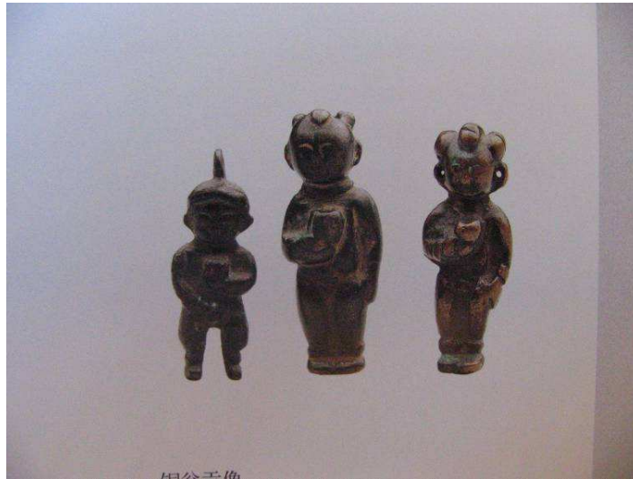
Fig. 3. Three ongons , bronze (5cm, 4,8cm and 4,3cm) excavated in Tongliao Municipality, Mongol Empire, Inner Mongolia ( Nei Menggu bowuyuan and Zhonghua shijitan yishuguan (eds) 2004: 310-311).

The Mongols used to feed their ongons by smearing their mouth and sometimes the whole face with fat and cooked meat before each meal, by sprinkling, and fumigation. 17 In exchange, the spirit was thought to commit itself to respecting a contract, whereby he would protect the household or clan and the sheep and cattle, bestow prosperity, prevent sickness, and ensure success in hunting, otherwise he could expect reprisals. An important feature in the definition of an ongon is the food that maintains a spirit into the support: the spirit remains within it as long as it is fed. As Roberte Hamayon (1990: 404) noted for 19 th century Buryats, 'c'est la nourriture qui maintient un esprit dans son support et [...] un esprit a besoin de son support pour être nourri; base du traitement rituel des ongon , elle est leur principal sinon unique élément commun fondamental, car varient formes et matières, procédés de genèse et de fabrication, modalités de culte et d'appartenance, esprits hébergés (animaux ou humains) [...].' Human spirits that could dwell in an ongon were either angry and potentially dangerous human spirits, or great ancestors. 18 The stone human statues and the effigies of Chinggis Khan, being material supports allowing the dead to be fed, can therefore be included in the large category of ongons . The stone statues holding a cup can be compared to small bronze ongons dating from the Mongol Empire holding a cup in their hand ( fig. 3 ).