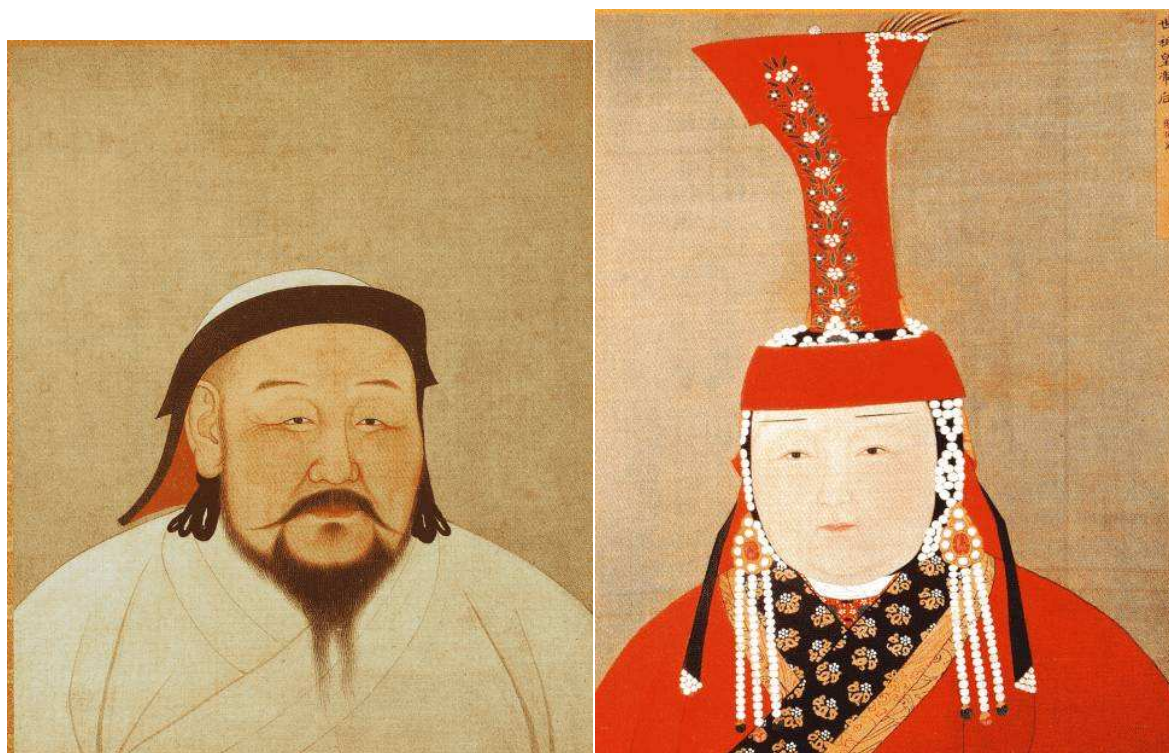
Fig. 4A. Portrait of Qubilai Qan (Shizu 世祖), album leaf, ink and color on silk, 59,4x47cm, China, Yuan dynasty, from Yuandai di banshen xiang 元代帝半身像, Collection of the National Palace Museum, Taipei.