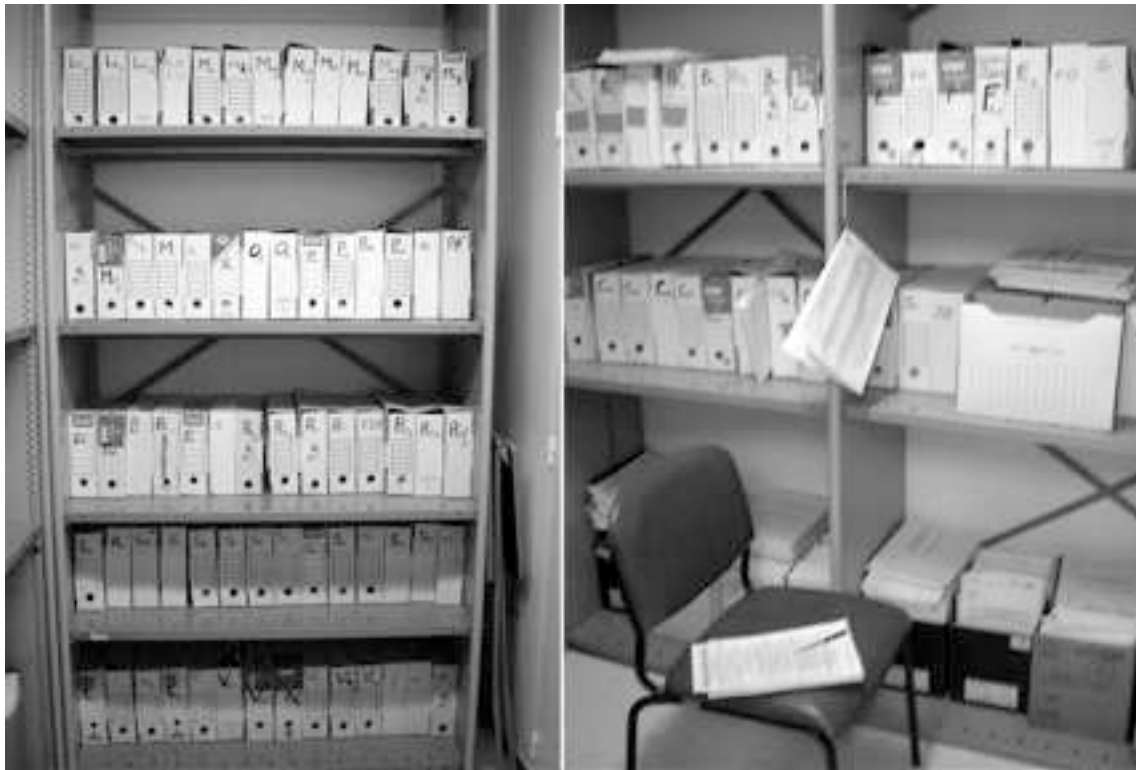
Figure 1. The stored research booklets room

The first thing Kelly did when she arrived was to spend several hours carefully sorting out the research booklets. This classification was twofold. First, she began by placing the research booklets for each patient in chronological order in box files. Then she arranged the box files in alphabetical order. This handling activity did not entail either reading or making sense of the research booklets, but merely noting the dates of the health checks and the patients' names – although the activity did require some concentration. By placing the research booklets in the box files and then arranging the latter, Kelly was imposing a spatial organization on the documents.