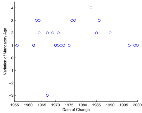
Figure 1: Variations of Mandatory Years of Schooling in Europe 1950-2000