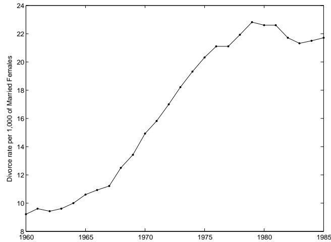
Figure 1: Divorce Rates per 1,000 of Married Females