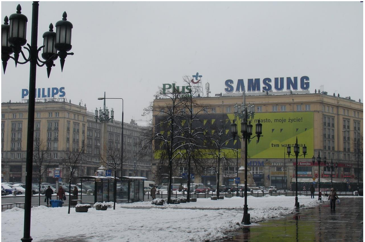
Figure 5 : Advertising on the Constitution Square, Warsaw. LCL, 2009

This “bazar“ economy was partially transferred to two big metallic warehouses which temporarily occupy the square. Meanwhile, one of them accommodated a supermarket, whose owner is now a very welfare businessman in Poland. Moratoria succeeded one after another, and these two unsightly hangars stood on the square until the end of the year 2008. Erection of kiosks, of commercial provisory buildings, of big advertising banners on the roof of the warehouses undoubtedly transformed the landscape around the Palace of Culture, whose basement was hidden; the open space itself disappeared under this commercial profusion. It lost its ideological signification under entirely new functions, and the landscape plainly reflected this new land use.