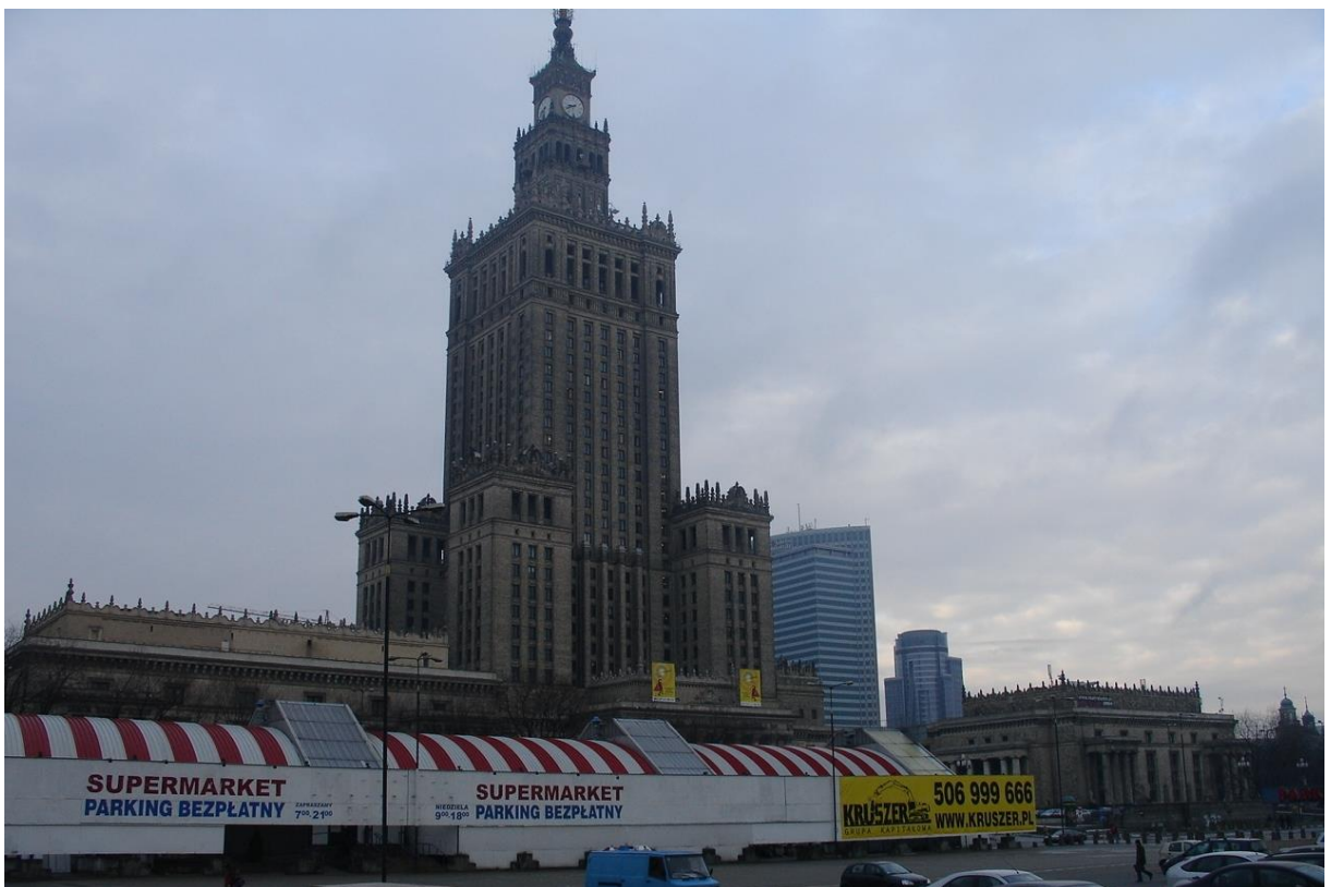
Figure 4 : The supermarket on the Defilad Square, Warsaw. LCL, 2009.