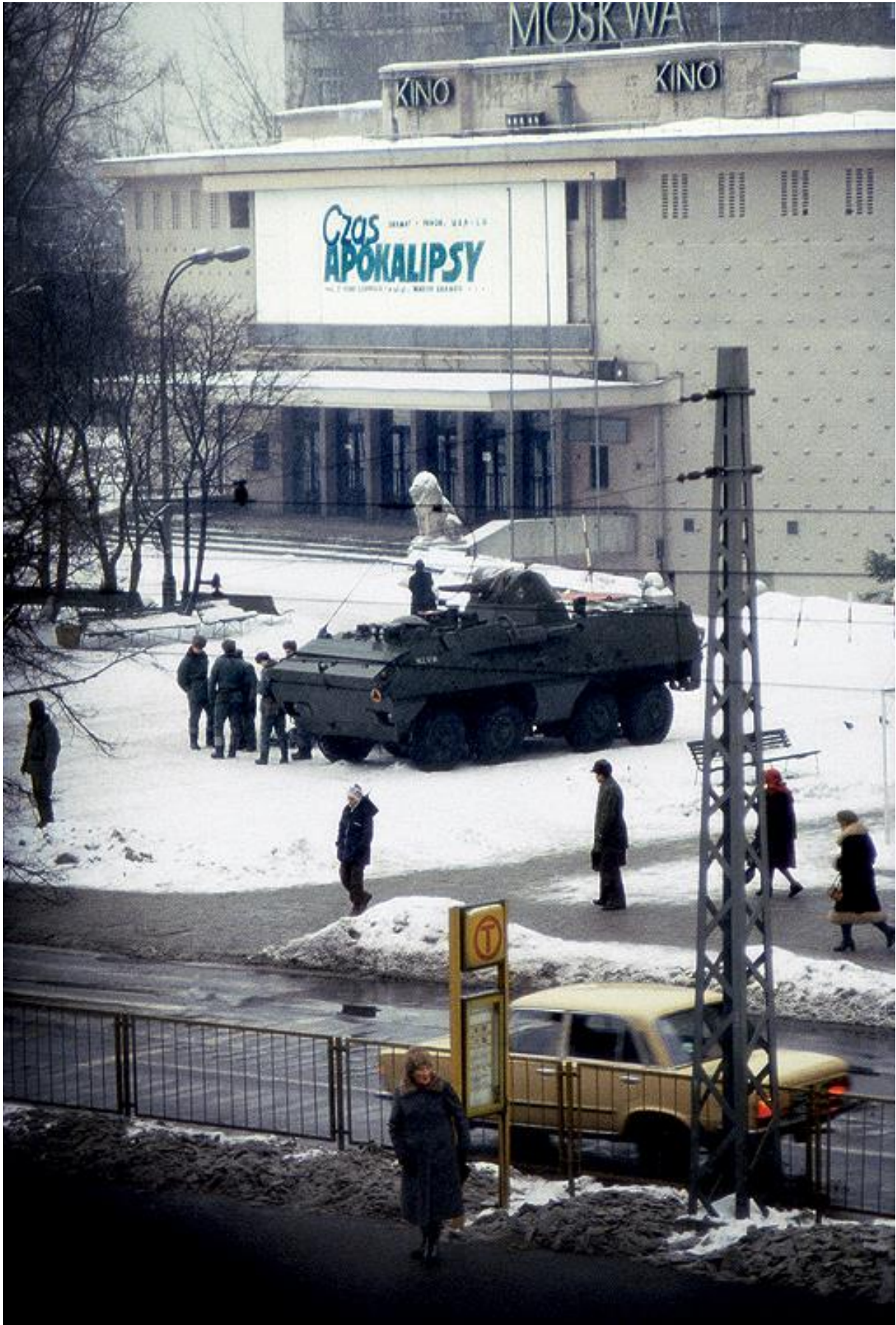
Figure 6: The Kino Moskwa shot in 1981, Warsaw.