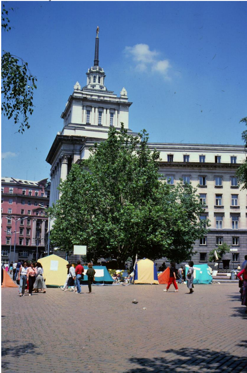
Figure 1 : The City of Truth in front of the House of the Party, Sofia MG, 1990

the Academy of Architecture of the USSR, and finally in 1947. After this third competition the Party House was erected, approved by G. Dimitrov, who was then the Prime Minister 10 . This occurred in a particularly historic moment: the proclamation of the People's Republic of Bulgaria in September 1946 and the adoption of a new Constitution in 1947. The construction of the Party House represented an official celebration of the new system and participated in the legitimization of the new political power. The project of the architect P. Zlatev was ultimately adopted. In its totalitarian architecture - both in its forms, its symbols, and its the relation with the surroundings - the Party House overlooks on the west-side the walls of the ancient Roman city Serdica. The location is central, in continuity to the House of Commons and the Sveta Sofia and Alexander Nevski churches. Its front overlooks one of the oldest square of the city, the Largoto square (renamed Lenin at that time). In 1990 it was surrounded by the tents of the «City of the Truth»: the protest movement of the first Bulgarian so called “free elections” won by the Socialist Party .