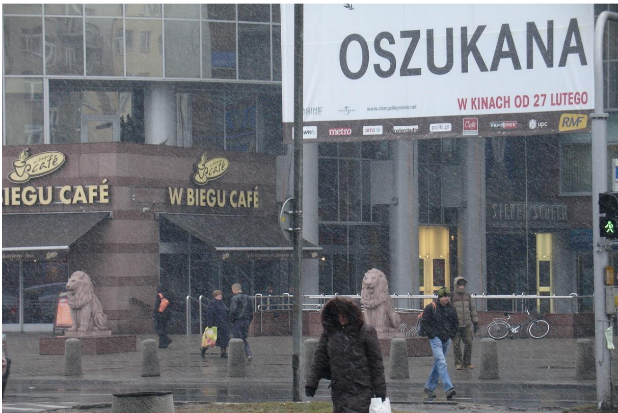
Figure 8 : The statues of lions, remaining of the Moskwa cinema, Warsaw. LCL, 2009.