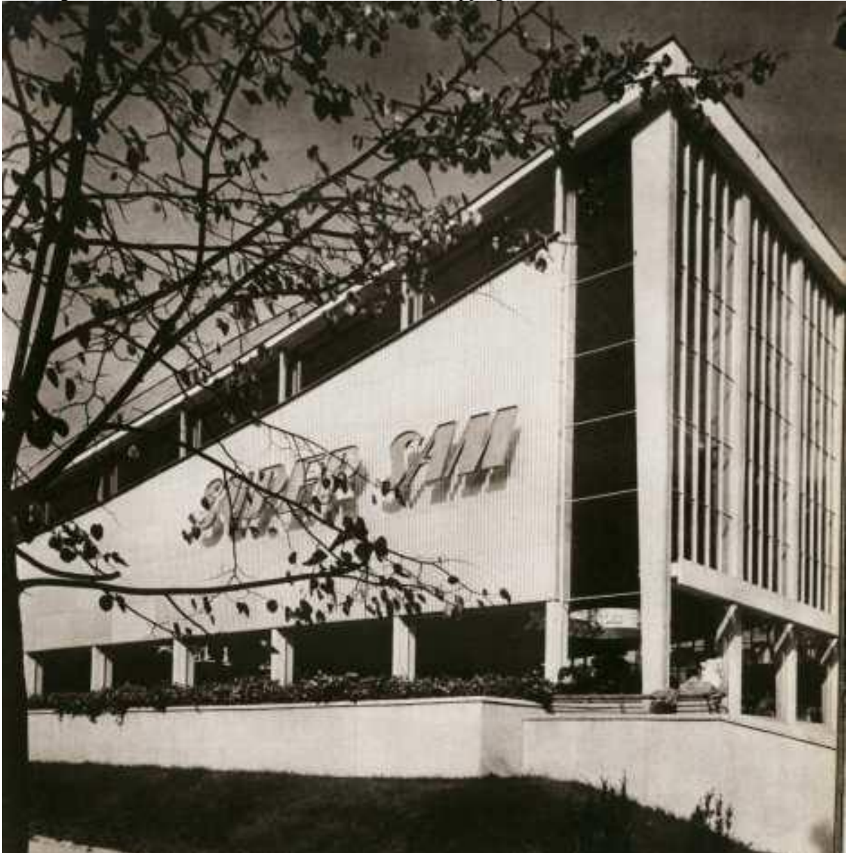
Figure 9: The Supersam, Warsaw. E. Kupiecki, 1973.

The first supermarket opened in Poland in 1962 in Warsaw; its name is Supersam (arch. Jerzy Hryniewiecki). Its architecture is an example of modernism, and when it was built, not only the concept of self service was entirely new in the country, but the building's design as well; a very high and suspended roof provided an imposing volume, and much light. The supermarket was closed for technical reasons of security, and its last owner, an investment fund, did not try to restore it; the building was demolished in 2007 in order to build a shopping mall.