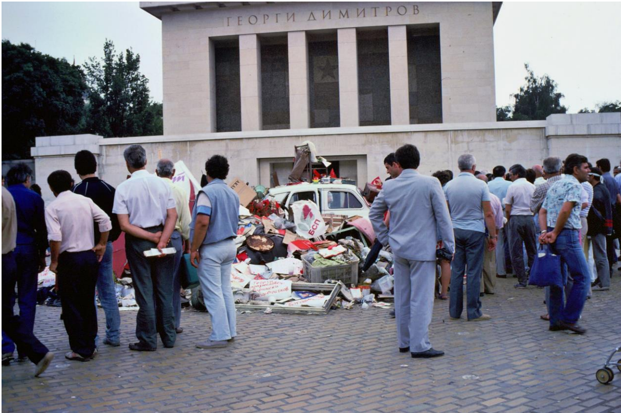
Figure 11: The Waste Party in front of the Dimitrov Mausoleum, Sofia. MG, 1990.

What then with the mausoleum? Through a competition, the architects suggested to transform it into a modern ruin partially destroyed, in a park gathering the best achievements of the socialist realistic art, into a pantheon of all victims of oppression (Turkish yoke, fascism, totalitarianism), or into a National Museum warehouse. Finally, the mausoleum was dynamited in September 1999, before the official visit of the U.S. President Bill Clinton. For some, the disappearance of the mausoleum meant a great step forwards; for others, it was seen as a mistake, because they identify it to a deny of history; thus it could not help the Bulgarians in the construction of their history and common memory. One part of the Welow Square (the former square of September 9 th 1944) was transformed into a parking. Large advertising posters for whisky took the place of the mausoleum in 2000. Recently, in summer, a stage has been erected for a world festival of folklore dance.