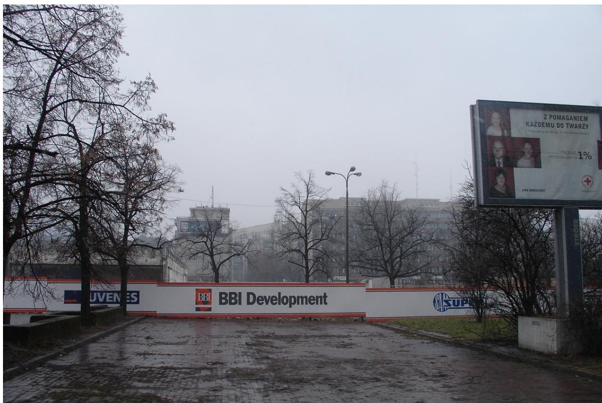
Figure 10: The Plac Unii Lubelskiej without Supersam, Warsaw. LCL, 2009.