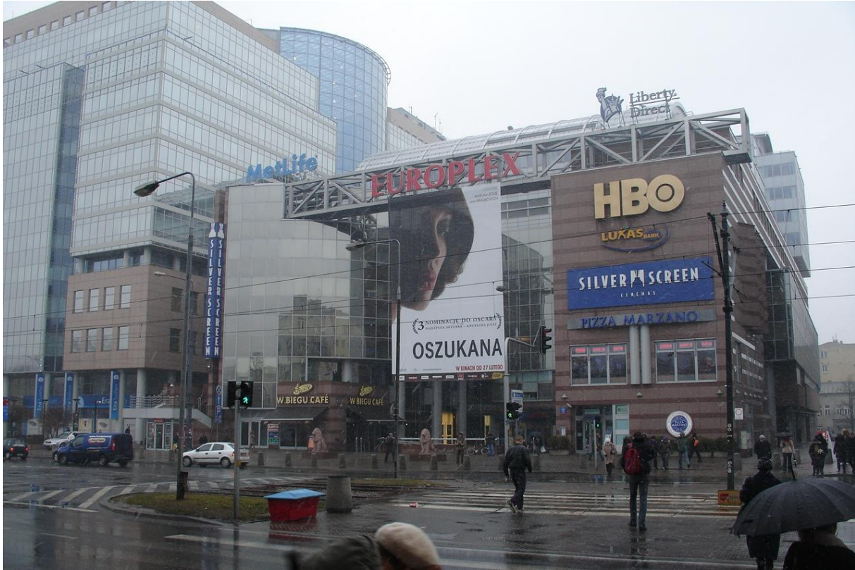
Figure 7 : The Silver Screen Building, instead of the Moskwa Cinema, Warsaw. LCL, 2009