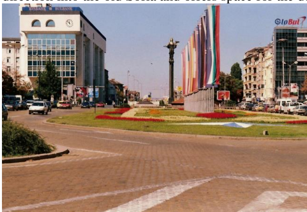
Figure 2 : The Largoto Square, Sofia. MG, 2002.

The square is now undergoing further transformations: the construction of two buildings on the Largoto square for business purpose is under preparation. Furthermore, at the occidental extremity of the square the statue of Sophia was erected, exactly where the Lenin monument used to stand. The new Master Plan of Sofia 2007-2020 opens a breach in the occidental direction into the old Sofia and offers space for the development of a new CDB