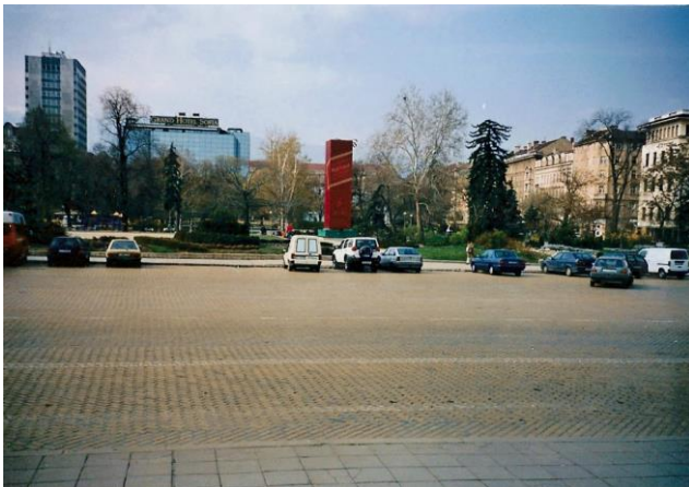
Figure 12 : New Symbols, Sofia. MG, 2000.

What then with the mausoleum? Through a competition, the architects suggested to transform it into a modern ruin partially destroyed, in a park gathering the best achievements of the socialist realistic art, into a pantheon of all victims of oppression (Turkish yoke, fascism, totalitarianism), or into a National Museum warehouse. Finally, the mausoleum was dynamited in September 1999, before the official visit of the U.S. President Bill Clinton. For some, the disappearance of the mausoleum meant a great step forwards; for others, it was seen as a mistake, because they identify it to a deny of history; thus it could not help the Bulgarians in the construction of their history and common memory. One part of the Welow Square (the former square of September 9 th 1944) was transformed into a parking. Large advertising posters for whisky took the place of the mausoleum in 2000. Recently, in summer, a stage has been erected for a world festival of folklore dance.