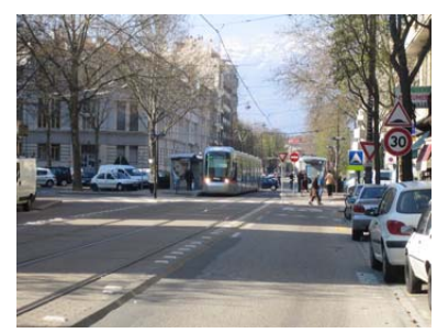
The landscaped setting of the Ile Verte neighbourhood

However the walkability of these districts should not only be judged by their landscaped or commercial attractiveness. On the contrary, walking is the result of a complex combination of conditions determined by practical possibilities, the pedestrian's own wishes and the ability of the environment to stimulate perception.