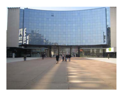
The minerality of the Europole district