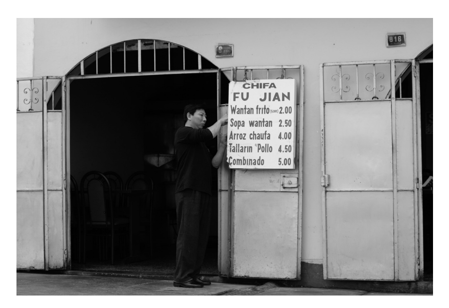
Fujian immigrant who has taken over a small chifa (Chinese restaurant) in a popular neighborhood in Lima.

Pluto Street in Lima's Chinatown. Since 2000 there has been a significant increase in the number of internet parlors that allow new migrants to keep in touch with their relatives in China and the Chinese diaspora elsewhere.