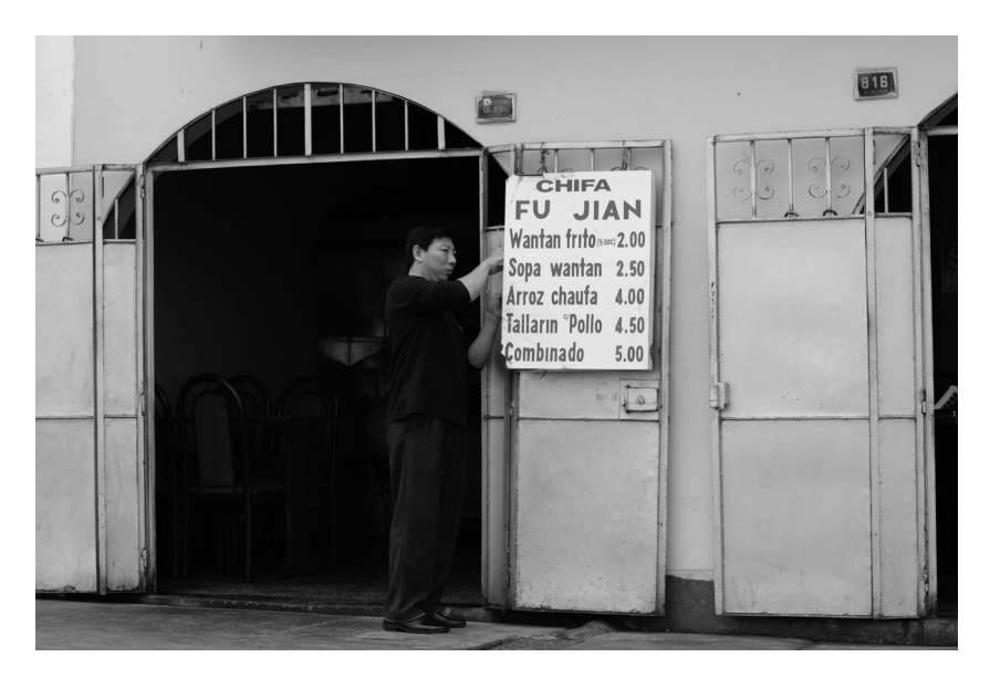
Fujian immigrant who has taken over a small chifa (Chinese restaurant) in a popular neighborhood in Lima.

Pluto Street in Lima's Chinatown. Since 2000 there has been a significant increase in the number of internet parlors that allow new migrants to keep in touch with their relatives in China and the Chinese diaspora elsewhere.