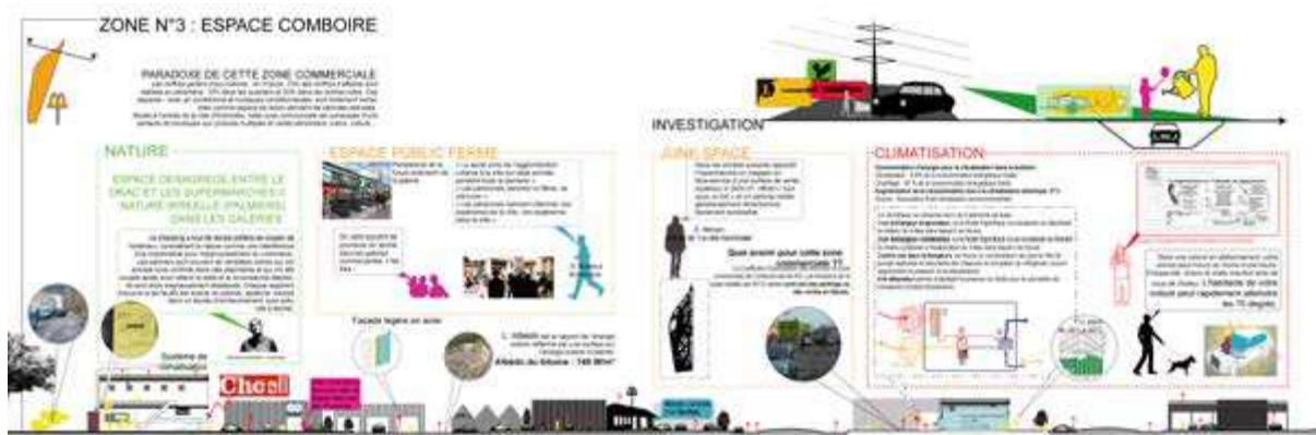
Figure 1: “Climatic section”, Grenoble-Echirolles, detail 1 (F. Ivol, A. Bordean, masters students, 5 th yr, ENSAG, 2008)