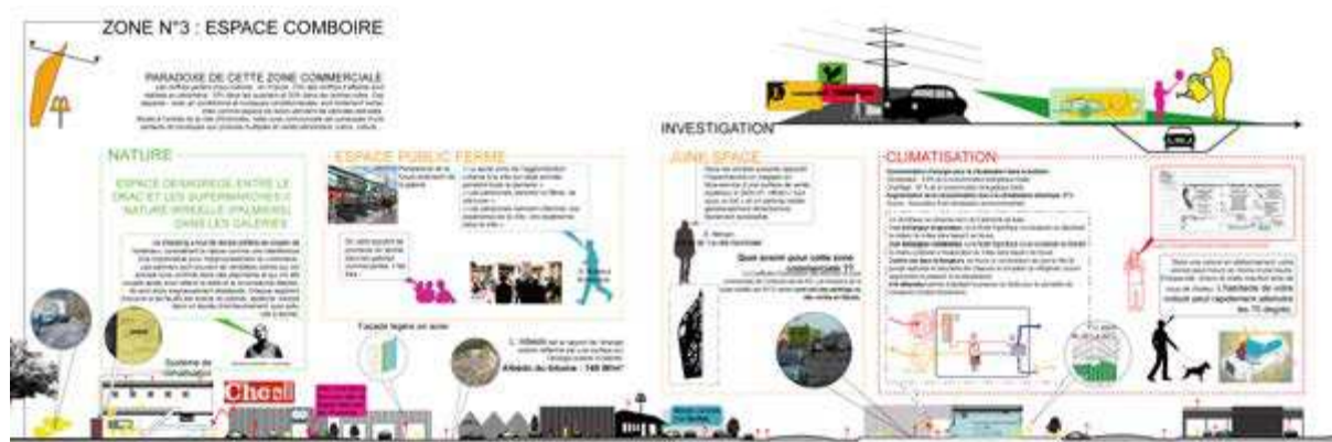
Figure 1: “Climatic section”, Grenoble-Echirolles, detail 1 (F. Ivol, A. Bordean, masters students, 5 th yr, ENSAG, 2008)