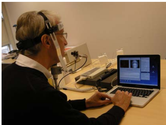
c) Taking data with Ultraspeech