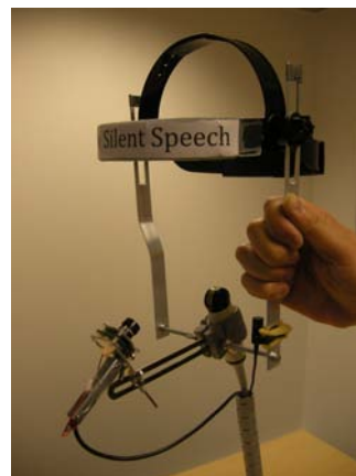
b) Detail of helmet