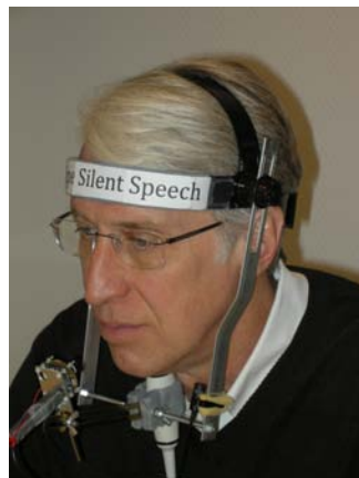
a) Lightweight helmet

We report here on tests of a new, lightweight SSI, which can be easily carried, is relatively independent of operating environment, and can already be used to perform simple interactive demonstrations. The system is described in section 2. Section 3 presents results from some simple tests of the system on demonstrator applications. Conclusions, more recent developments, and perspectives for the future are discussed in the final section.