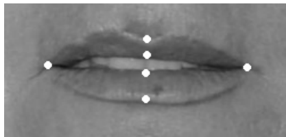
Figure 2: Picture of the lips at rest position taken with the video camera (60 fps), and the 6 points that served to determine on the vertical axis, the inner and external aperture, and on the horizontal axis, the stretching between the commissural of the lips.

Matlab program was built-up in order to allow for analysis. On every other frame, points were placed manually in 6 reference places (Fig 2) to measure the external and internal opening, and the stretching-rounding of the lips and euclidean distances were then calculated (in pixels) between these points. Each word was composed of about 70 to 100 frames.