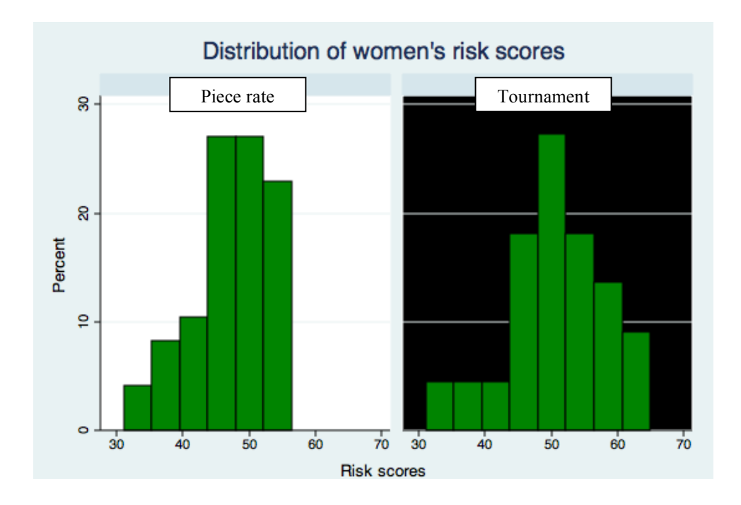
Appendix 2. Risk Distributions