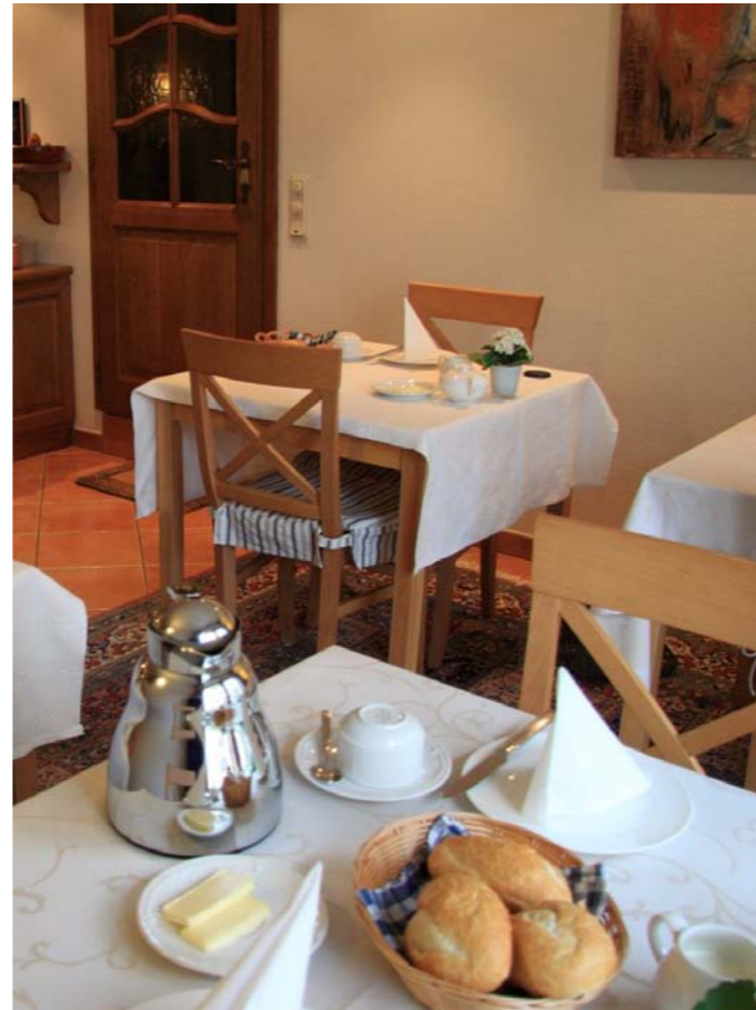
Liège - ENTI 2011