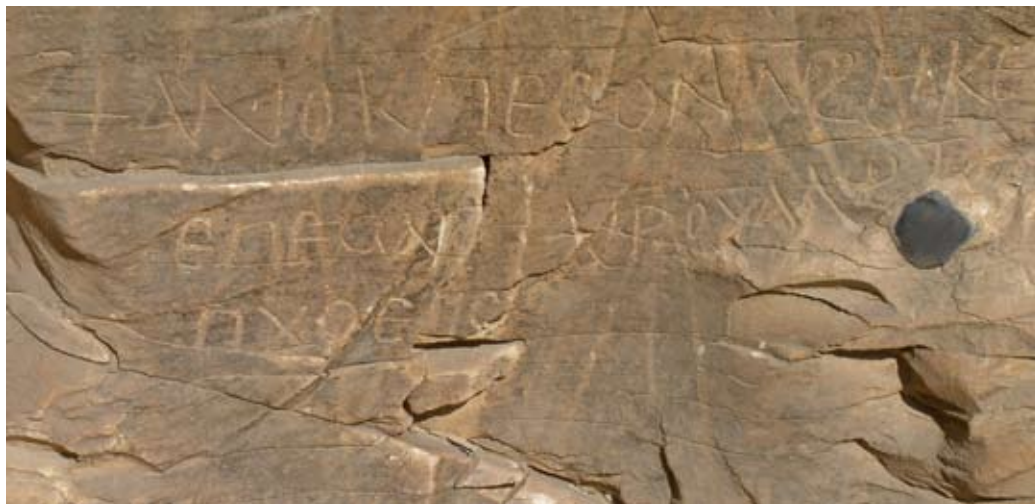
Graffito engraved on the external walls of the small 'chapel' C7 situated in the Valley of the Spanish Pilgrims, mentioning 'a chore for the Lord'

In 2007, a small sounding was carried out to the west of the Deir er-Rumi and brought to light some economically significant ostraca which complete the series found in 1994. They bear witness to the involvement of the monasteries in the social and economic life of the region.