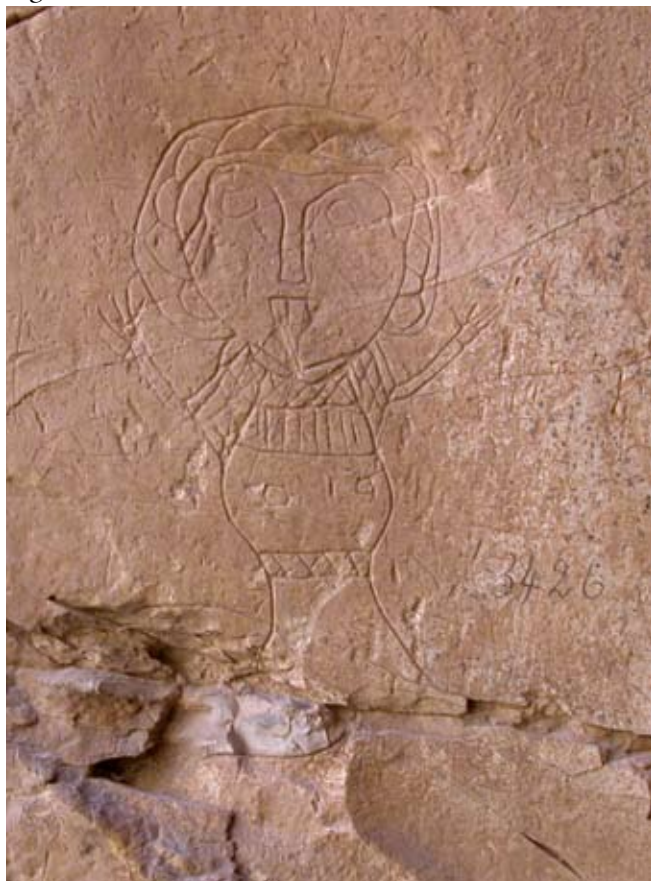
Graffito representing a holy character engraved on the rocky wall near the shelter referred to as 'the shelter of the lying man'