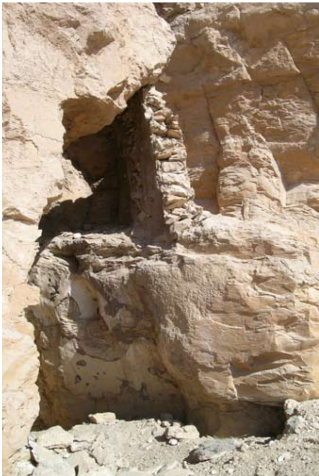
View of the entrance to the small 'chapel' C' 7 situated above the Valley of the Queens