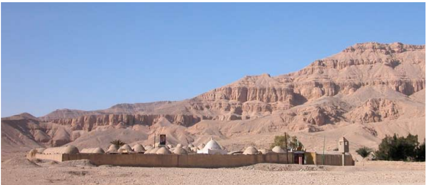
View of the southern part of the Theban Mountain with, in the foreground, the Deir el-Mohareb

The wadis situated around the Valley of the Queens (Valley of the Three Pits, Valley of the Rope, the Valley of Prince Ahmes) constitute a coherent geographical ensemble: the cavities that have been located there (which probably served as shelters or retreat cells for hermits) no doubt belonged to the same monastic ensemble. The Deir er-Rumi (see cover photograph), situated at the entrance to the Valley of the Queens between the Valley of the Three Pits and the Valley of the Rope, seems indeed to have been the central element of a laura . In the necropolis, old tombs were manifestly put to new use, such as tombs 1, 58, 60 and 73 in the Valley of the Queens. In the wadi further to the south other remains have been located. These can be identified especially