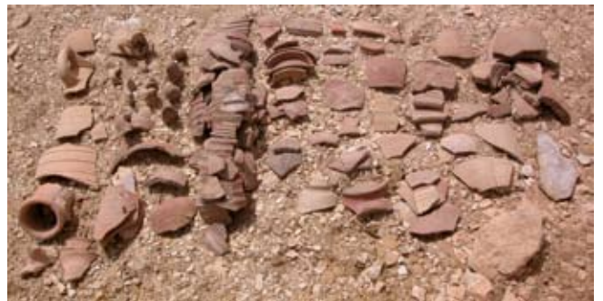
Ceramics found in front of shelter C 9 situated above the Valley of the Spanish Pilgrims