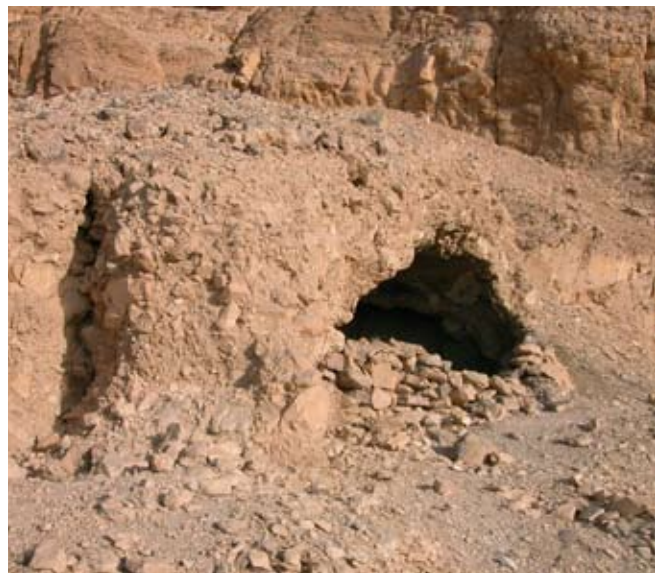
Entrance to shelter C 9 situated above the Valley of the Spanish Pilgrims