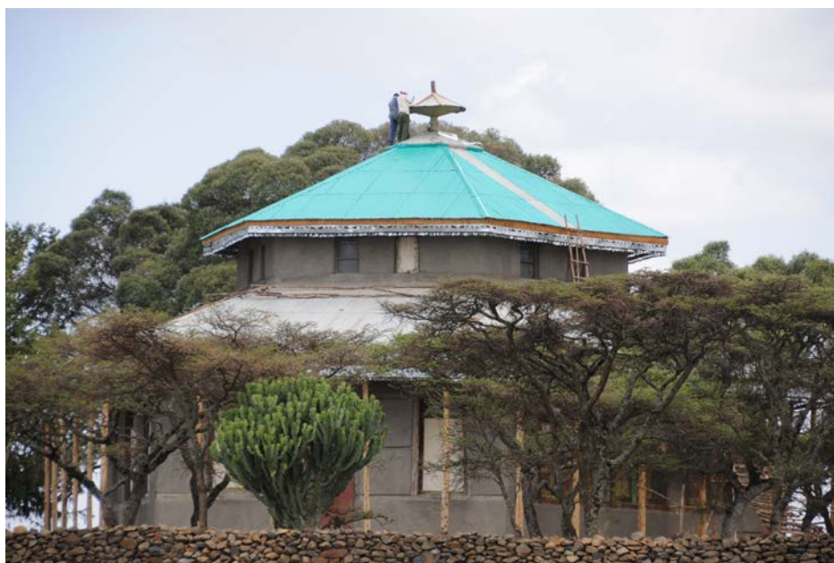
Mängəstä Səmayat

To have a better understanding on the foundation, we have to analyze the sources of the time when it is said to have been edified. The late documents date the construction of Mängəstä Səmayat during Ləbnä Dəngəl's reign. That is why our investigation will start from his chronicle.