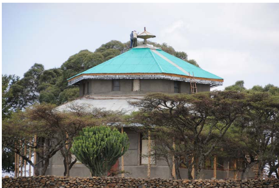
Mängəstā Sämayat

To have a better understanding on the foundation, we have to analyze the sources of the time when it is said to have been edified. The late documents date the construction of Mängəstā Sämayat during Ləbnä Dəngəl's reign. That is why our investigation will start from his chronicle.