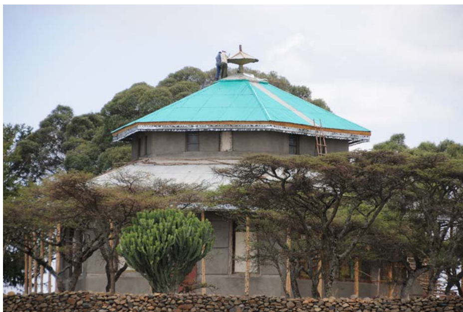
Mängəstä Sämayat

To have a better understanding on the foundation, we have to analyze the sources of the time when it is said to have been edified. The late documents date the construction of Mängəstä Sämayat during Ləbnä Dəngəl's reign. That is why our investigation will start from his chronicle.