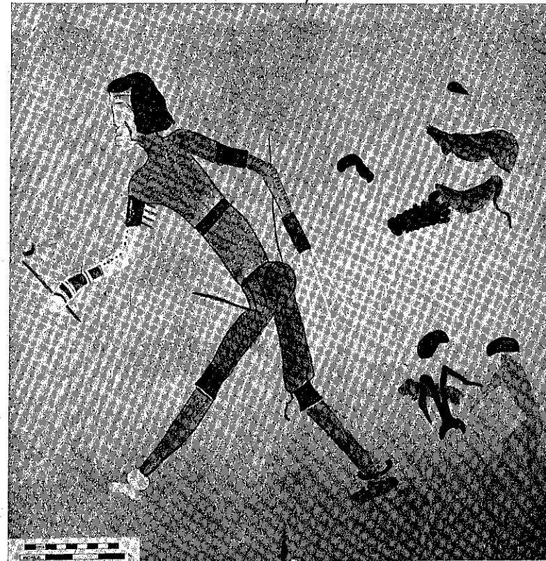
Plate I.—The last figure in the Brandberg frieze. The "European" nose has had Negroid features added below. Above, photo from the actual rocks; below, photo from a tracing.