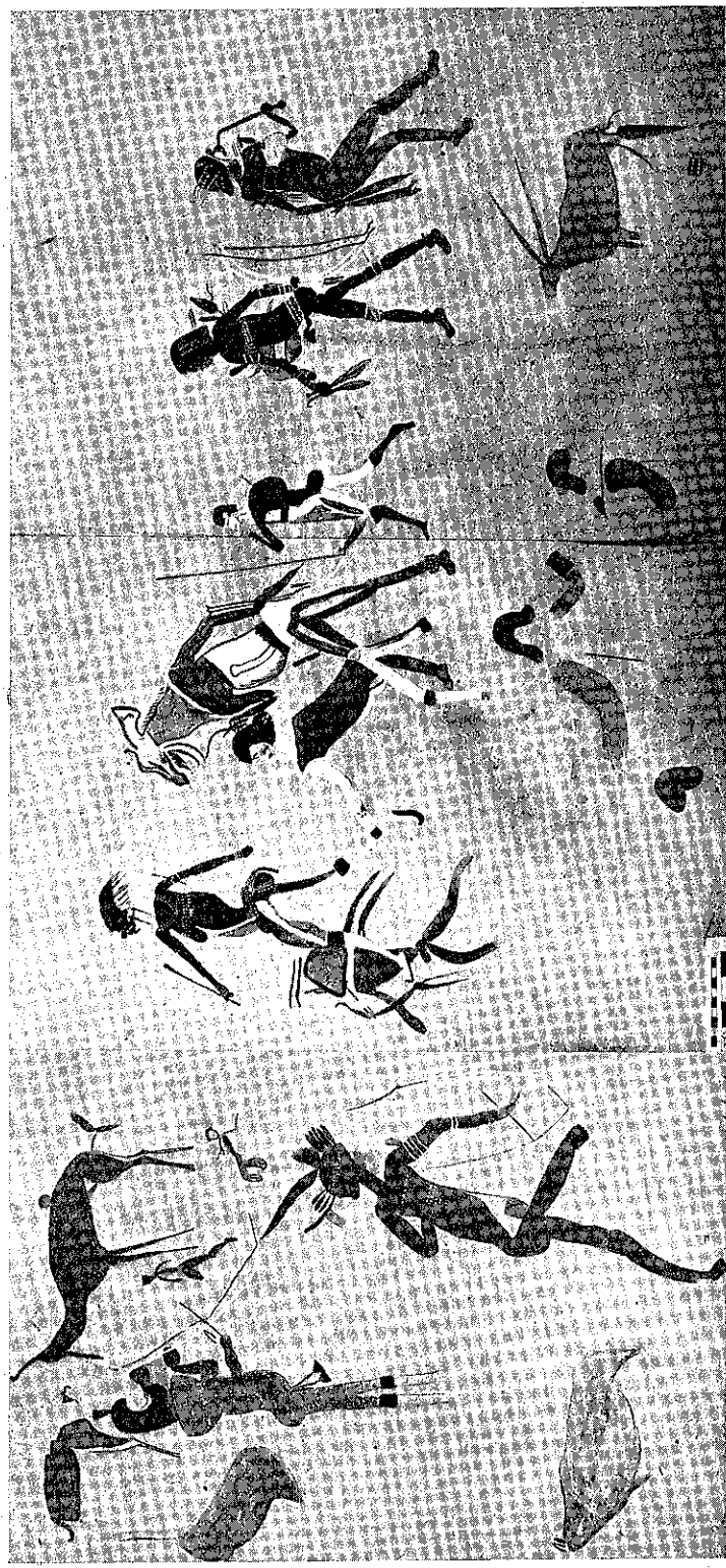
Plate III.—Left half of the Brandberg frieze, with the "White Lady" to the right of the centre.