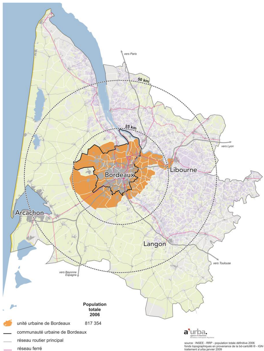
Figure 1 –Bordeaux urban area