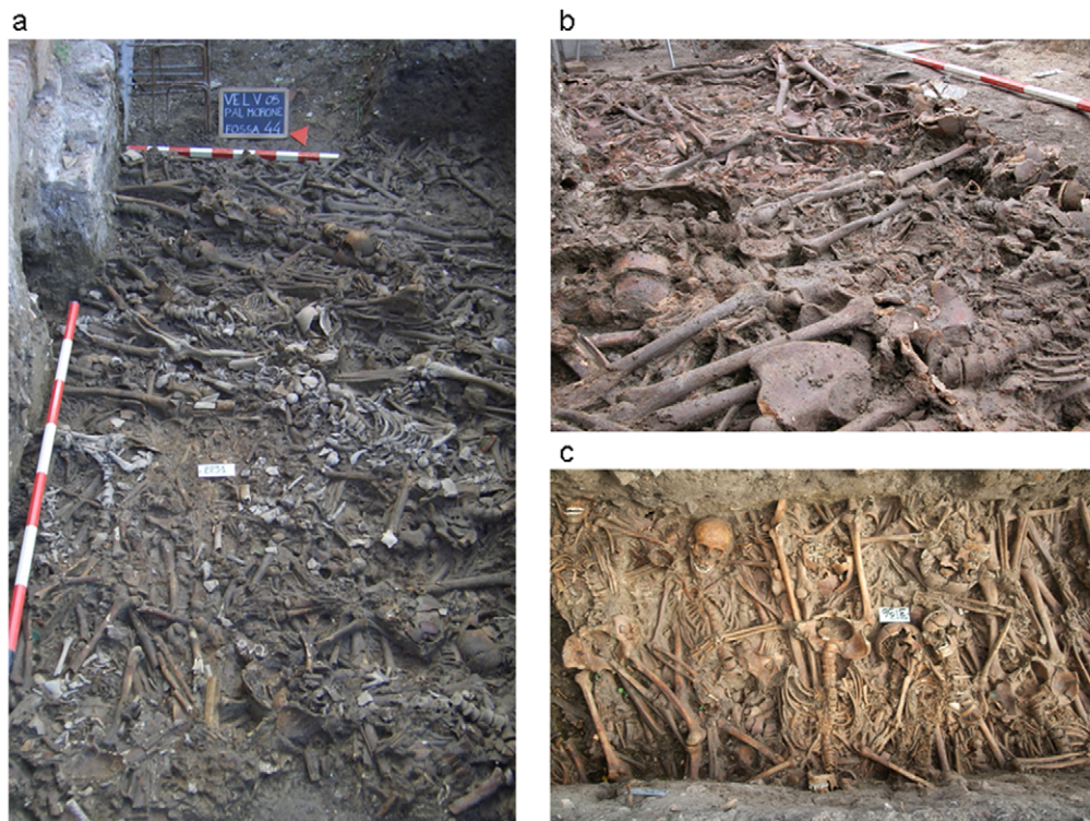
Figure 1. Three views of the medieval plague burial sites in Venice, Italy. a: grave 2; b: grave 35; c: grave 44. doi:10.1371/journal.pone.0016735.g001