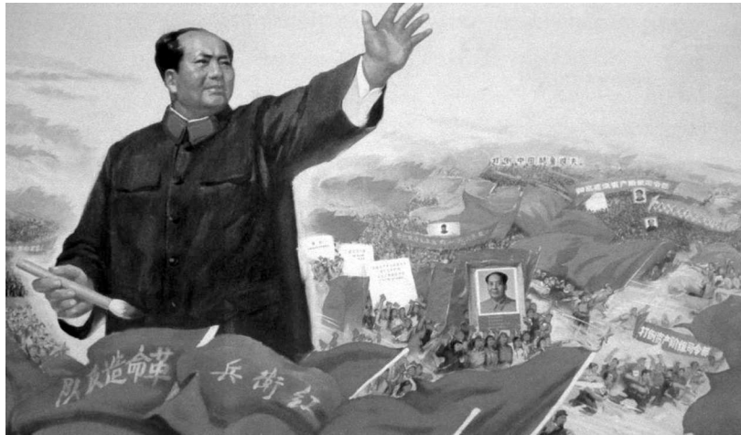
Figure 7: Follow Closely Mao's Great Strategic Plan , Anonymous (1968), in Galikowski 1998: n.p., fig. 14.

a simple calligraphic style, "Only socialism can save China" (fig. 8). 23