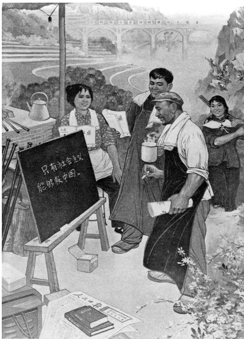
Figure 8: Song Enmin, Rough Hands Want to Transmit the Truth (1977), from 1977 Nianhua suoyang, dier pi .