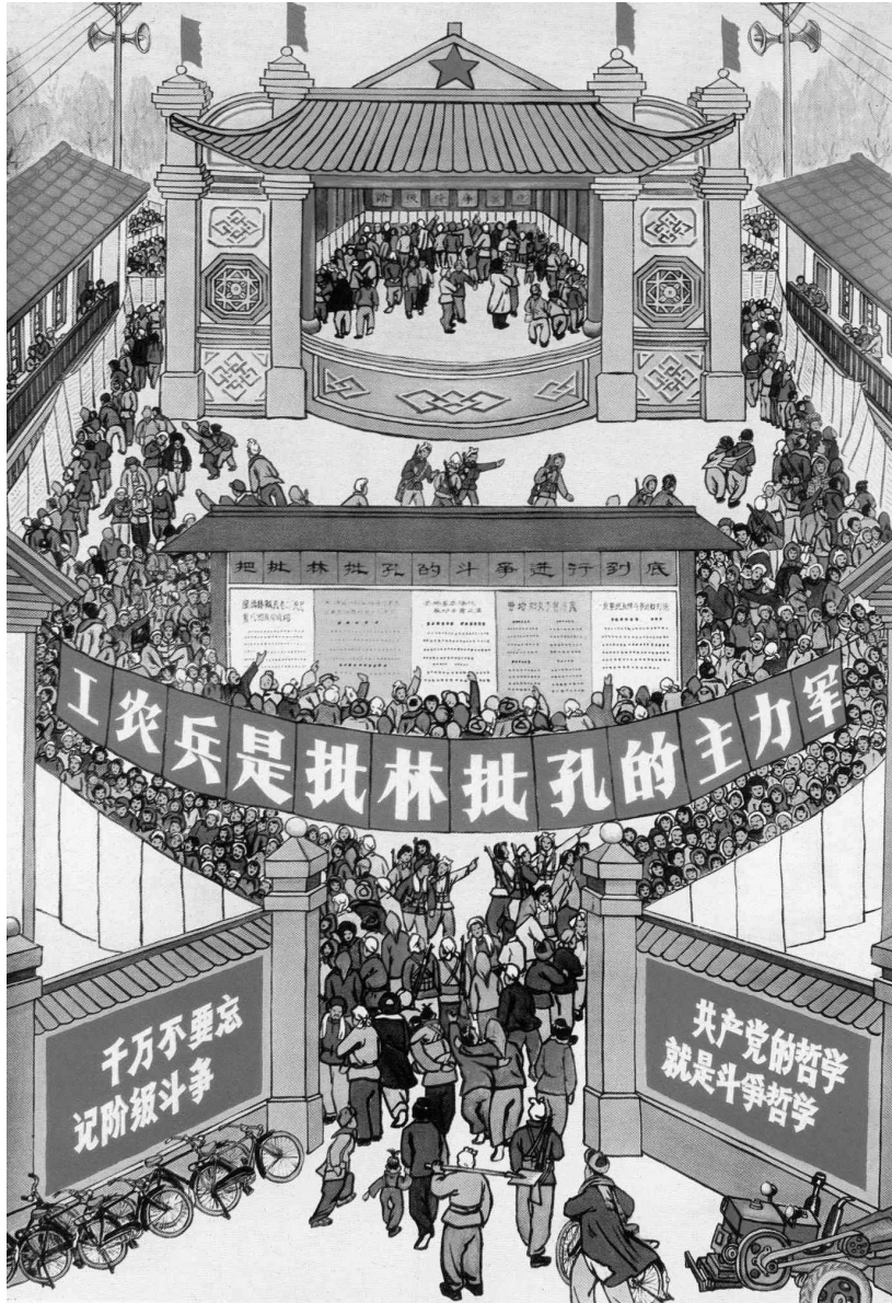
Figure 6: Yang Zhixian, An Exhibition to Criticize Lin Biao and Confucius , in Guowuyuan wenhuazu meishu zuopin zhengji xiaozu bian 1974: 11.