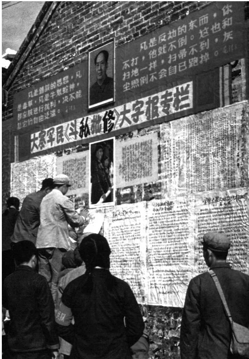
Figure 1: From Hong taiyang zhaoligangle Dazhai qianjin de daolu (The red sun shines over the progressive road of Dazhai) (Beijing: Waiwen, 1969).