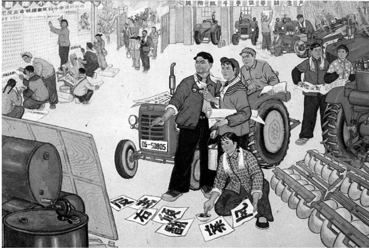
Figure 9: Han Baoku, War Drums Speed Up the Coming of Spring (1977), in 1977 Nianhua suoyang, dier pi .

the brush still in his hand, while three other people around him intently appraise his work: a woman with an ink bucket and a roll of paper under her arm, looking as if she is about to start her own composition; a younger woman squatting on the ground and completing a series of characters to be hung as a banner; and a young man copying the text in a notebook. Every person in this poster is engaged in some way in the acts of writing or reading, as if these acts, not the proper operation of the factory, were his