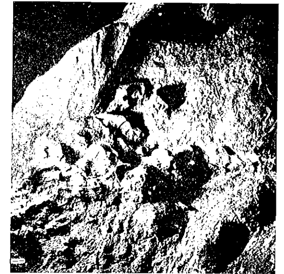
Fig. 5. Accumulation of cave-bear skulls in the "Abelgang," a side recess in the Drachenhöhle.—Although the "chiropterite" contained an enormous number of bones and teeth of the cave bear, it was only in this recess that we found the skulls lying side by side. This photograph was made shortly after we began excavating, and shows eighteen skulls in situ .

It was a remarkable fact that these bones showed a rather peculiar arrangement. We found that almost all the bones at the bottom were small—chiefly metapodials and vertebrae; at a