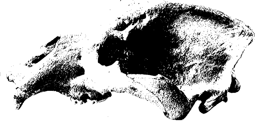
Fig. 1. Wound in the skull of a cave bear ( Ursus spelaeus ) from the Drachenhöhle.—The wound, made by a sharp stone weapon, never fully healed but ulcerated until the time of death. The basilar length of this skull is 45 cm. (17.7 inches). In the fireplaces of Neanderthal man, 1060 feet from the entrance of the cave, we found another skull with a fresh wound in the region of the muzzle. In all probability a blow on the muzzle would cause immediate death, while a blow on the forehead or above the eyes would not necessarily be mortal, and the animal might be able to escape. Even to this day the Slovaks of the Carpathian Mountains kill brown bears by a powerful blow on the muzzle.