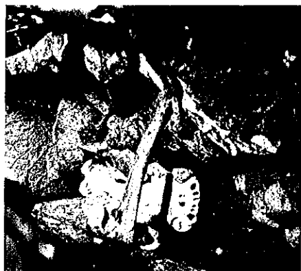
Fig. 7. Arrangement of the skull and ulna of a cave bear, believed to be the work of Neanderthal man.—In March, 1923, Dr. Josef Sebadler found the skull and ulna of a cave bear firmly fixed in the deep marginal fissure between the wall and the floor of the Drachenhöhle. All the circumstances make it most improbable that this could have happened as the result of a fall, or of the action of running water, or of any other operation of the forces of nature.

higher level arm-bones and leg-bones predominated; then came a great series of pelvic bones; and the uppermost layer was composed chiefly of skulls and jaws. Some of the bones were badly rolled, or weathered, or