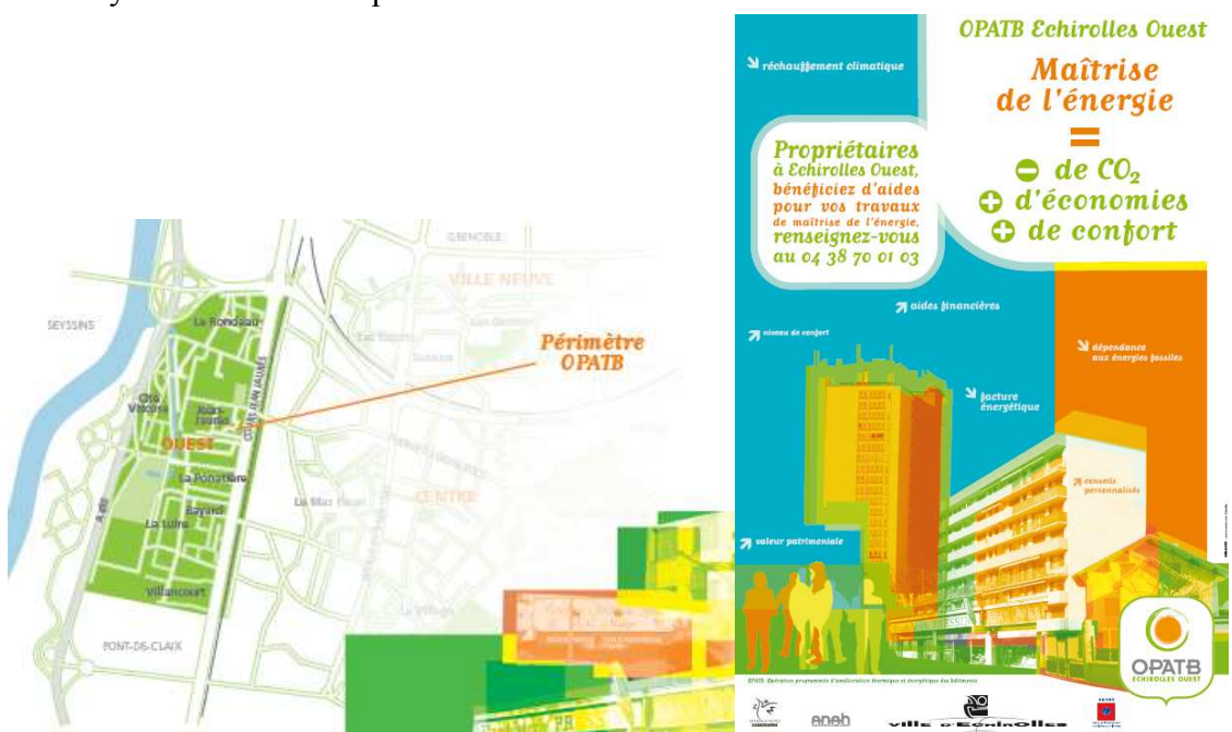
Figure 3 Perimeter and posters of West Echirolles OPATB.

diversity of sectorial thematic and the different categories of people. Since then, it has led to systematic follow-up actions with the residents.