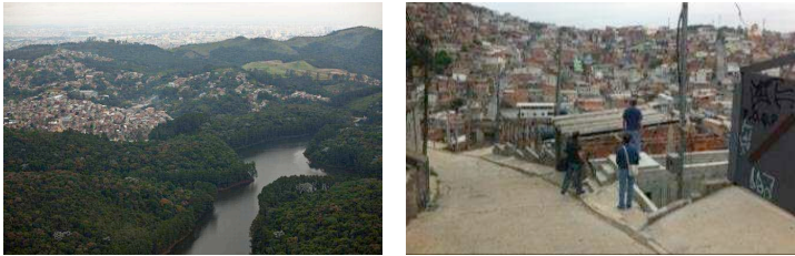
Figures 1 & 2. Cabuçu River and the configuration of the Urban Area (Fabio Knoll, 2011)

The selected area of this proposal lies in the micro basin of the river Cabuçu de Cima, it is located in the north region at the sub prefecture of Jaçanã Tremembé in the municipality of São Paulo.