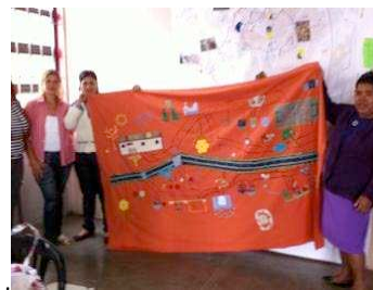
Figure 11. The tapestry made by them with the Linear Park by the river (P. Mendes, 2011)