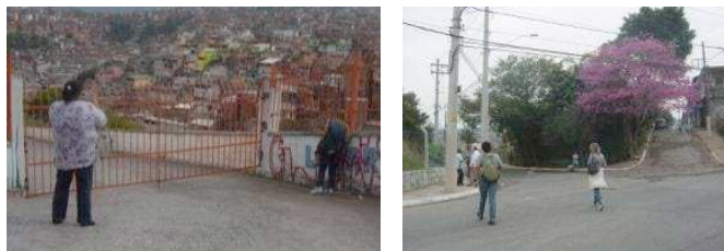
Figures 5 & 6. The registration of the residents in the walking (P. Mendes, 2011)

A walking through the territory was another tool used to mobilize residents to review their neighborhood and its problems. It was inspired at Thibaud (2001) methodology called parcours commentés . We provided them cameras to take pictures of the situations that affect them both positively and negatively (a house, the garbage, the river, an inhabitant of a tree, etc.). They chose the paths that should be taken in this activity. They showed us how they move and circulate around the territory, their perceptions about the lived environment. Each group in this pathway was also stimulated by one coach seeking for their answers about the living environment.