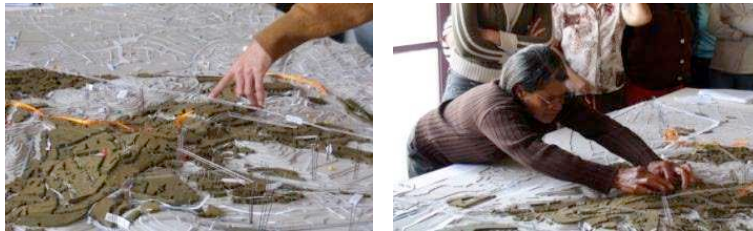
Figures 9 & 10. Residents discussing the issues of the territory (P. Mendes, 2011)

The scale model of the area was another tool that we used in the workshops with them to analyze the topography of the place, the shortcuts and risk areas. We began to work their perception about these areas, how they experienced the issues (the areas that usually flood during the rainy season and the empty lots that serve illegal waste disposal for example) and what they think about the technical proposal offered by the city hall.