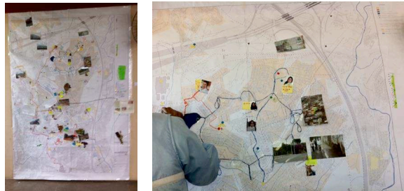
Figures 3 & 4. Map of the affections built by the participants (P. Mendes, 2011)

This tool had mobilized the participants to recognize their territory, study its scale, visualize their demands, their mobility in the territory, densification in the risk areas, lack of green areas, among other things. At the end the map of the affections help them to see all the issues of the territory and propose actions.