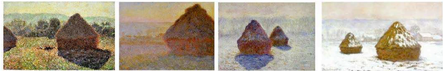
Figure 2. Les meules (Monet, 1890-1891), visual evocation of spring, summer, autumn and winter

Let's consider some audio-visual representations for temperature and wind. Various light and color effects may evoke a season and consequently give an indication of global temperature (figures 2 and 3). Post-processing methods may be used to modify saturation or value of colors. Moreover, we can draw our inspiration from cartoons studios and propose colors palette corresponding to seasonal light ambiances. In addition, we can use the depth of field which varies according to heat.