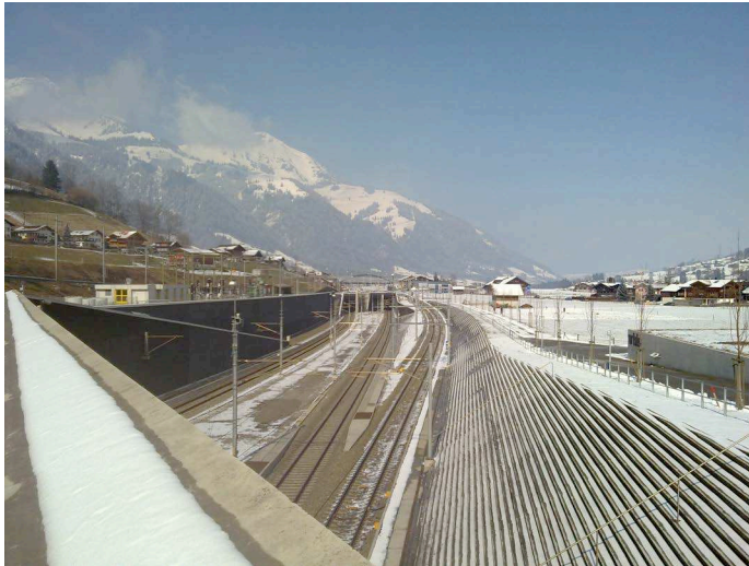
Figure 1. Entrance Lötschberg base tunnel

the other hand urban-quality transport facilities were also provided within the area itself – transport facilities that are every bit as good as an urban railway network.