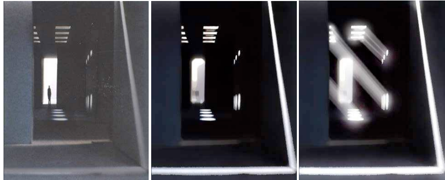
Figure 2. A mock-up picture (left) using the saturation, blur (middle) and adding direction clues (right) to pop-out lighting effects

Applying the active vision technique, the studied key feature has to pop-out from the global lighting intention. This popping effect can be achieved with graphic techniques as blur, color, movement, group, shape, etc. (Ware, 2008). The problem is to interpret the graphic technique and the associated lighting feature and to differentiate the features (fig. 2).