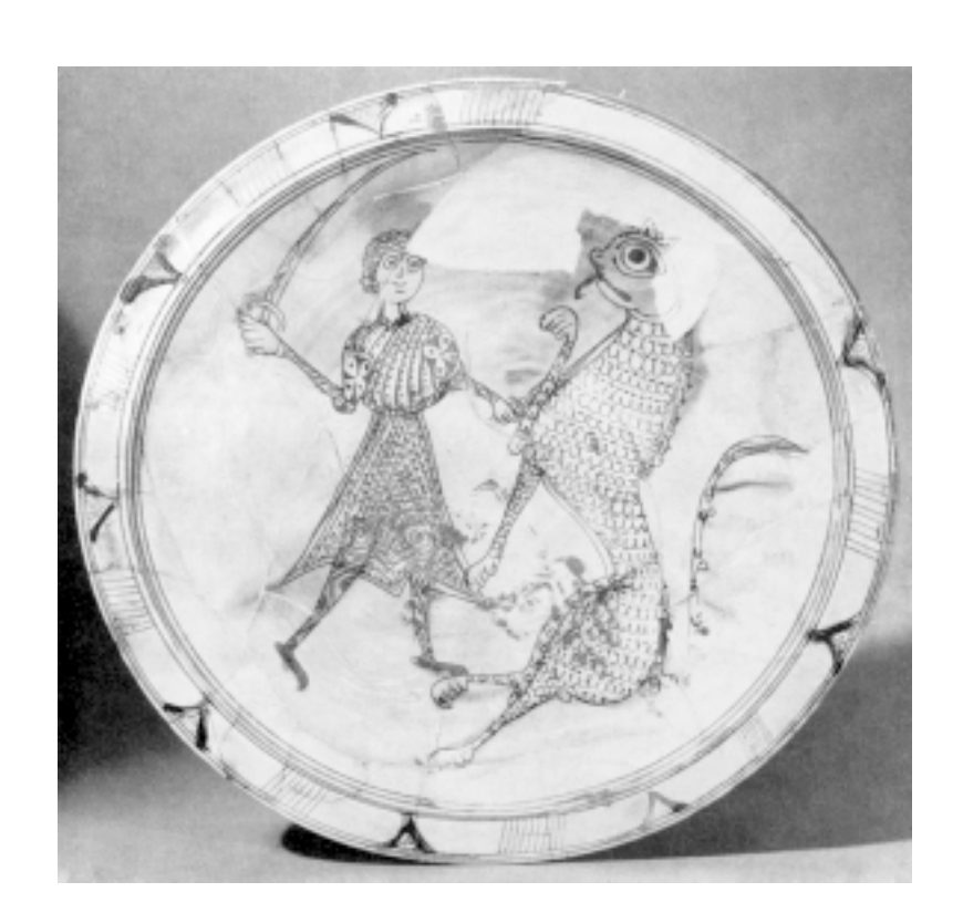
5. Zeuxippus ware. Hermitage x. 728 (after A. H. S. Megaw, "Zeuxippus Ware," BSA 63 [1968]: pl. 20a)