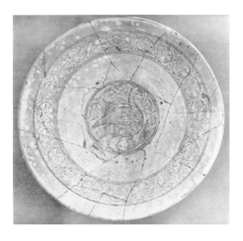
4. Corinth, Fine Sgraffito plate (after Morgan, Byzantine Pottery , 119, fig. 93, no. 965)