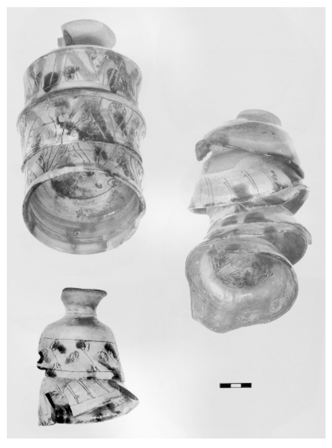
7. Vases deformed by excessive heat in the furnace (after D. Papanikola-Bakirtzi, Μεσαιωνική Εφυαλωμένη Κεραμική της Κύπρου [Thessalonike, 1996], pl. xxx)