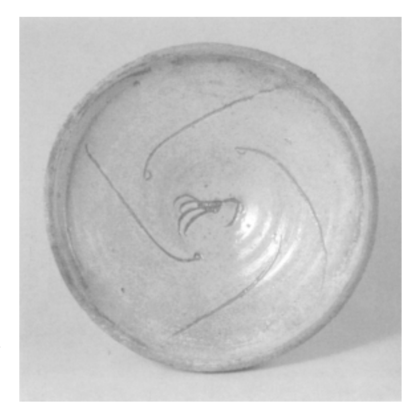
6. Receptacle, Aegean ware. Sèvres, Musée national de la Céramique, MNC 24782 (after J. Durand, Byzance: L'art byzantin dans les collections publiques françaises [Paris, 1992], 394, no. 303)