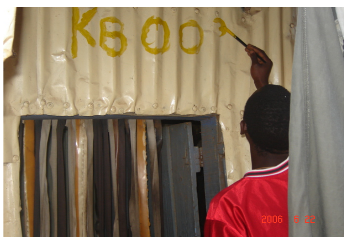
Figure 3: Community-led mapping and enumerations

Mapping and enumeration exercises were conducted to establish the total number of residents, assess their needs and provide a stronger advocacy tool that is based on specific issues (Pamoja Trust, 2011). Enumeration exercises involved door-to-door collection of socio-economic information and were largely community driven. The enumerations were conducted using questionnaires that were administered after rigorous consensus building by community members and other interested stakeholders. Subsequently, the community members were involved in the actual data collection as well as keying it in. Preliminary data findings were displayed, setting off a verification process that allowed for the rest of the community to ascertain that the information indeed reflected the state of the settlement.