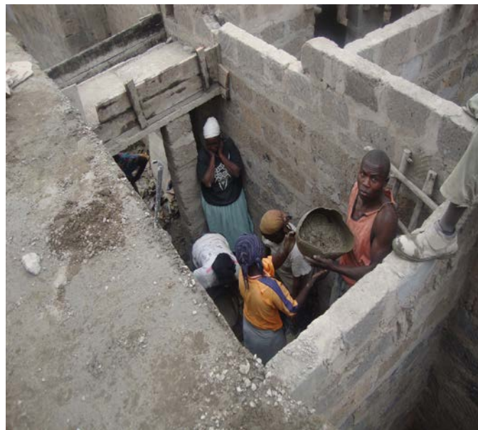
Figure 6: Construction in progress