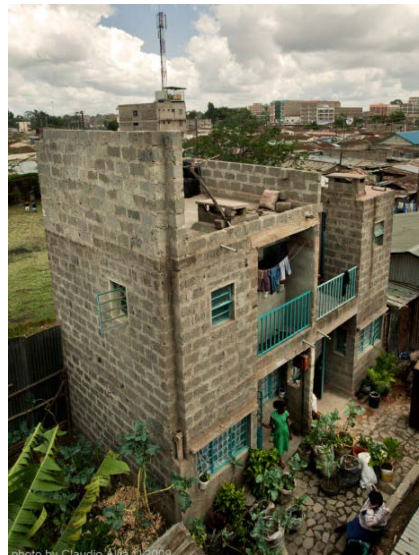
Figure 8: A housing unit in Kambi Moto