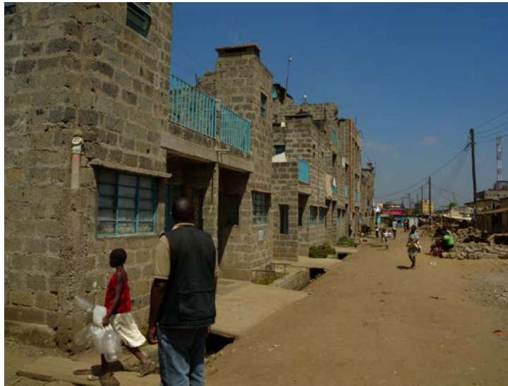
Figure 7: Kambi Moto main street

beams and ladiis were used, drawing lessons from the Indian Slum Federation. These were used in putting up staircases, windowsills, lintels and the foundation of the top level. Routine training on core construction skills and assembly of precast elements was done and this ensured optimum knowledge and skill transfer. To date, this initiative has seen the construction of over 200 housing units in Kambi Moto, Mahira, Gitathuru, Ghetto and Redeemed.