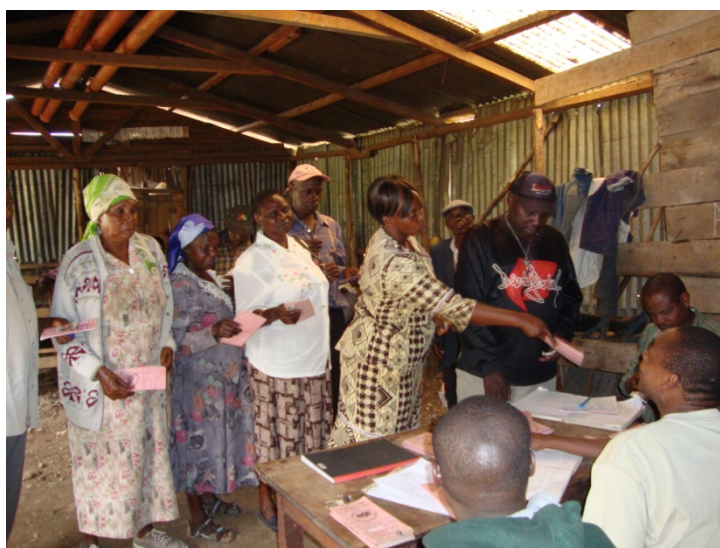
Figure 2: Community members present their daily savings books for update

Mobilizing any community around agendas such as land and housing is a challenge. The history of tenure in Kenya generates a lot of tension and suspicion, particularly among the urban poor. This situation called for continuous engagement with key influential people, including village elders and civic leaders. This mobilization allowed for more open discussions on the upgrading process and in so doing, important aspects such as gender mainstreaming and equal representation were emphasized. This ensured that women and other vulnerable groups were empowered and gained invaluable knowledge in the course of the upgrading exercise