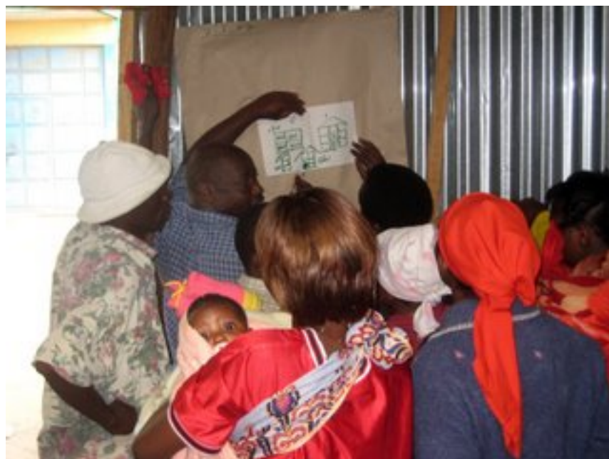
Figure 4: Community members discussing their housing dreams

With information obtained from the mapping and enumerations exercises, the community initiated discussions on issues such as housing and service provision. House dreaming and design were then carried out and of note here was the utmost regard taken in ensuring minimal spill over of residents. These suggestions were presented to an architect during a community meeting after which, the architect modified “the community dream” to suit the number of families and the size of land. The final design agreed upon by the community was then presented, in the form of a cloth model, to the whole community, the general public, the CCN and other stakeholders. During the presentation, the would-be-beneficiaries were able to critique the model in terms of suitability and practicability. This presentation formed the official launch of the upgrading programme.