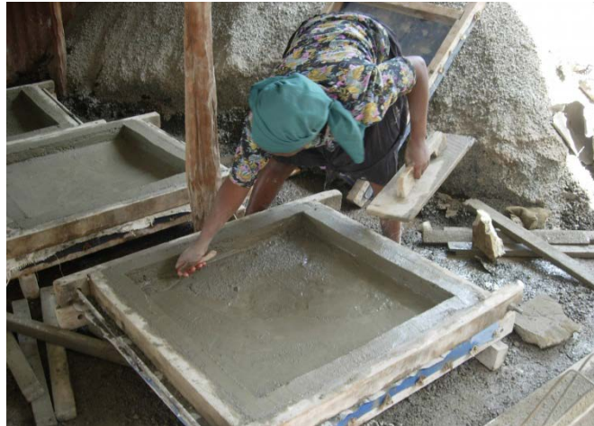
Figure 5: A community member producing pre-cast elements

After the necessary approval by the CCN, the first phase of upgrading began in Kambi Moto. The construction process relied heavily on community labour which was converted into sweat equity. This was one of the components that facilitated the considerably lower cost outlay for the initiative. Other cost reducing measures included the use of pre-cast elements and incremental construction.