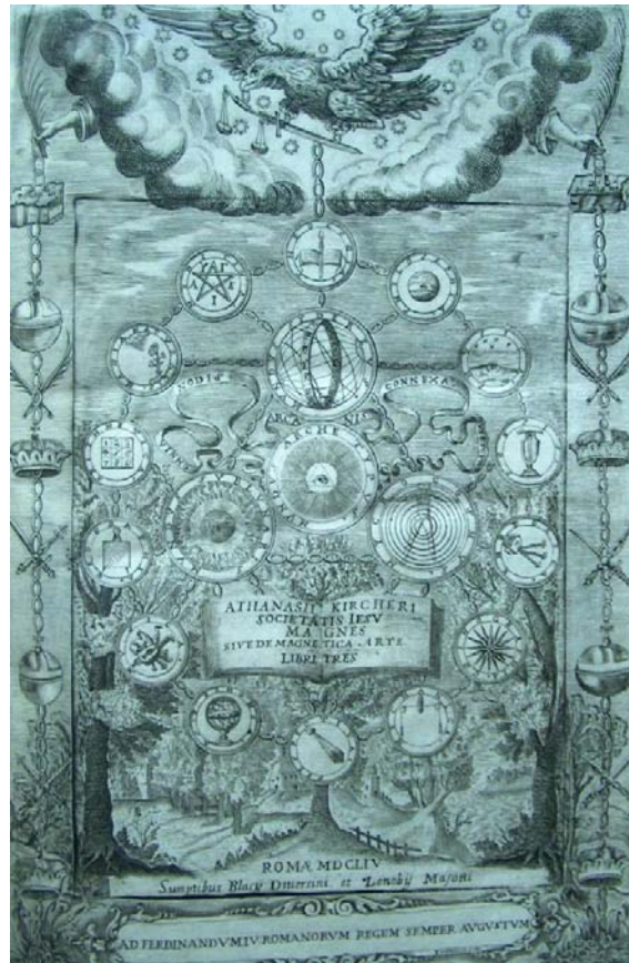
FIG 6: Frontispiece of Kircher's (1654) Magnes , composed by I.B. Rinalducus

The Magnes is subdivided into three parts: (1) on the nature and properties of the magnet, (2) on its applications in astronomy, natural magic, geography, navigation, etc., and (3) on its hidden workings throughout the world. This third part is divided into 10 sections, which are associated with the 10 branches of the Cabbalist Zephirotic tree. The ten sections of part three deal with the magnetism of the earth, the planets, the stars, the elements, the different parts of the earth, the tides, the plants, medicine, music, love and God. The body of the text, with its descriptions of mathematical and natural philosophical theories and instruments, is framed by a metaphysical or theological frontispiece and epilogue. This prominent placing at the beginning and end suggests that the whole work has a metaphysical and theological bearing.