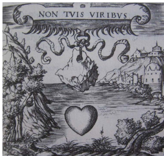
FIG 1: de Montenay (1584) Emblematum Christianorum centuria , p. 5

From the patristic times onwards, magnetism became a (modest) part of readings of the ‘book of nature’. In the Middle Ages, a more formal semiotic system of allegorical readings (in the broad sense) of scripture was developed. The quadrigia distinguished four levels of reading: (1) a literal reading; (2) a tropological or moral reading. This reading focussed on what to do and corresponded to the theological virtue of charity; (3) an anagogical reading. This reading focussed on what to strive for and corresponded to the virtue of hope. It had a prophetic or eschatological meaning; (4) an allegorical reading (in the narrow sense). This reading focussed on what to believe and corresponded to the virtue of faith.