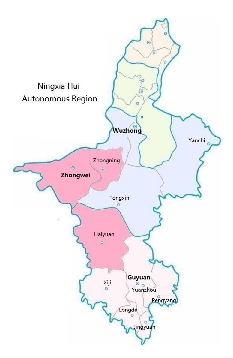
Figure 1 – Map of the surveyed prefecture-level cities and counties in Ningxia Hui Autonomous Region