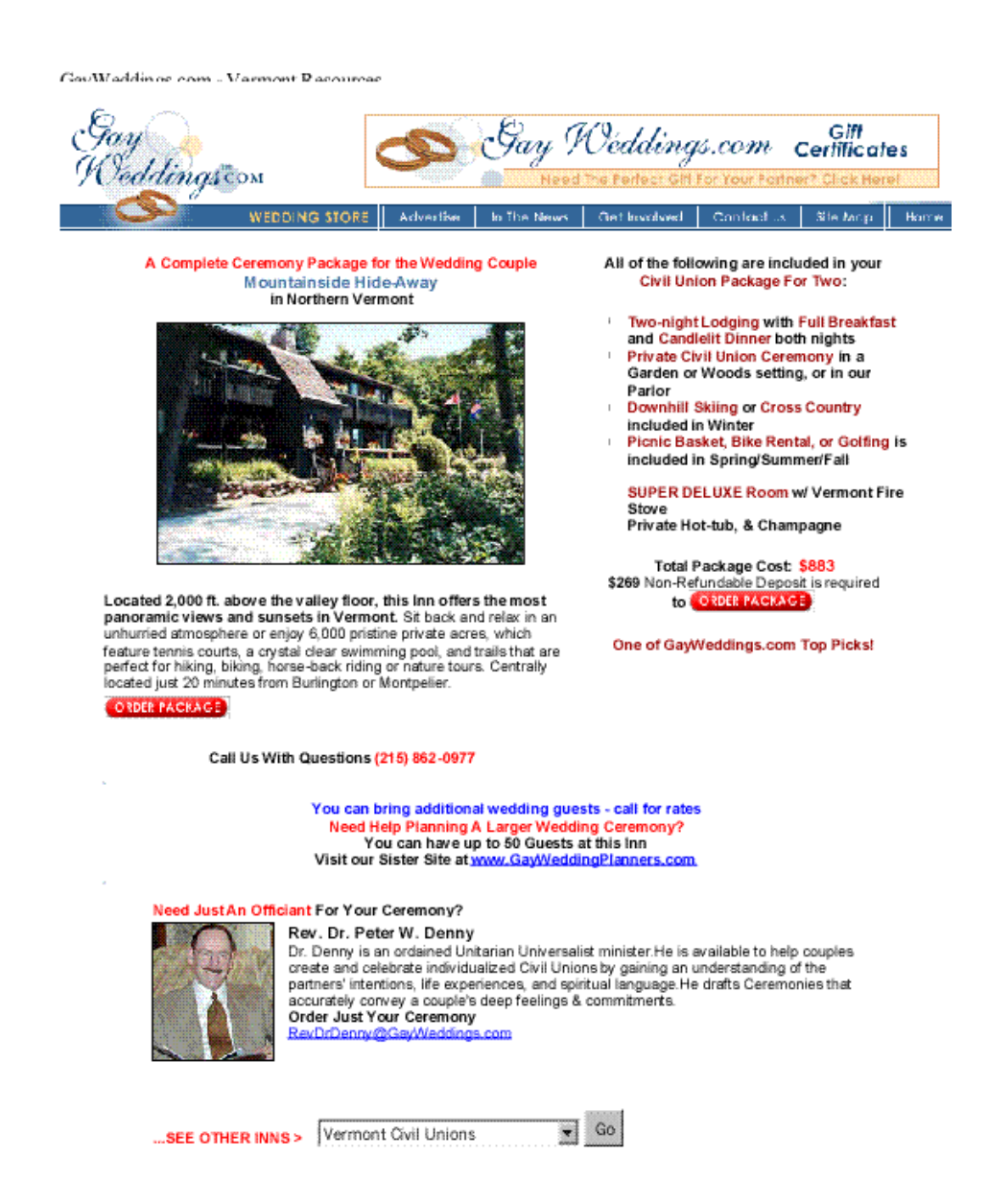
Figure 2: gayweddings.com