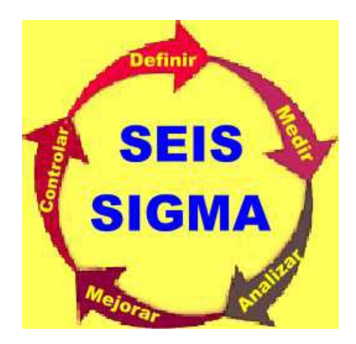
"A disciplined methodology for process improvement"

In short, Six Sigma methodology, or six steps method, it starts with a set of problems that request a wakeup call. The black belt will designate the specific problem and clarify the determining factors that affect, determining a hypothesis. The hypothesis is tested in one study, the improvements are identified and the solution implemented.