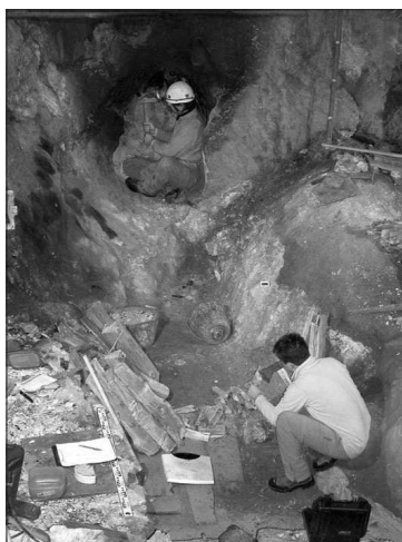
Figure 1. Experimental operating area (modern workings, Fournel mines).

To profit from good ventilation, experiments are held during the winter. Based on the initial work done since 1997, the rate of one fire per day was selected to allow the cooling of the rock face between each fire, and better