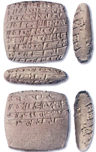
Tablet Kt v/k 147a: Envelope; 5,5x5x2,6 cm.

This marriage contract contains a reciprocal clause in case of divorce, with the same penalty for both parties: 2 minas of silver (1 kg). But there is a stipulation which intends to protect the wife: the husband must not treat her badly. On line 8 of the tablet and 17 of the envelope, the scribe made a mistake typical for Anatolian writers, 4 using the feminine pronoun suffix instead of the masculine, to refer to the husband.