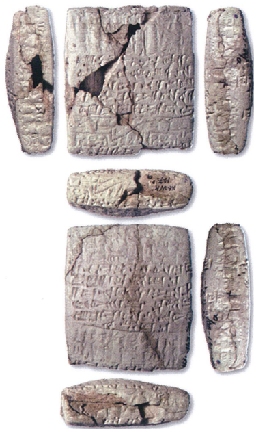
Tablet Kt v/k 147b; 4,3x4,1x1,5 cm