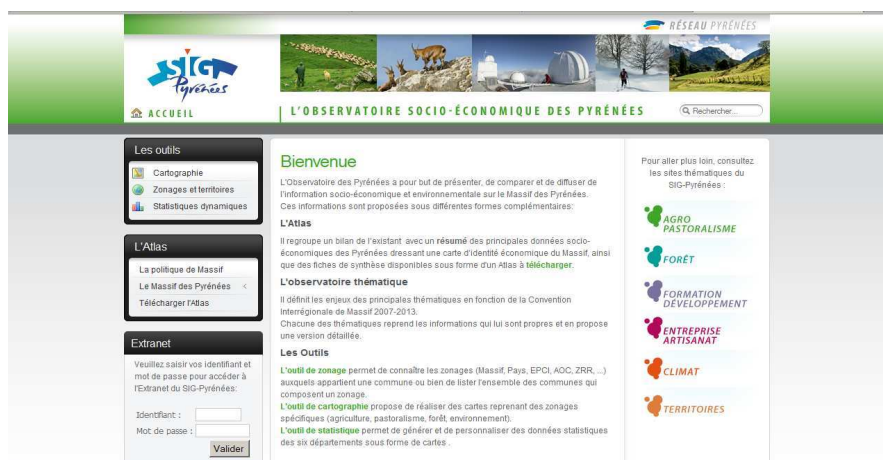
a. Construction by successive building blocks of the SIG Pyrénées

This association has been supported for the past 12 years by the consular structures of the Pyrenees Mountains. The aim of the APEM is to contribute to the economic development of the regions lying within the Pyrenees Mountains. “The APEM constitutes a link between techniques and territories, by relying on the know-how of its partners in the Pyrenees Network” 6 . To fulfil this aim, the APEM created an observatory encompassing the entire area : a tool known as the SIG Pyrénées. From the beginning, this tool has been dedicated to issues concerning economic mountain development.