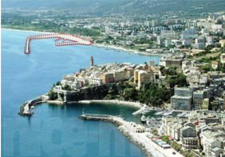
Fig. 2.: Structure of the new commercial port on the site of the "Carbonite".

To this extent the question of development model is emerging now. The classical view of local planning is changing. We are passing from a top-down vision to a bottom-up spatial planning, which is not without its problems in terms of management of public affairs. Overall, the conception of local development seems to be questioned.