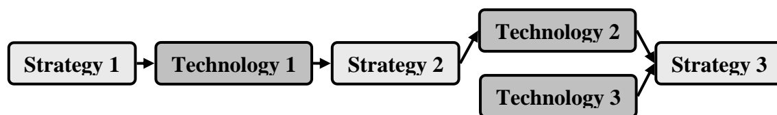
Exhibit 6. The Dynamic Interaction Between IT and Strategy

Perhaps one of the most noteworthy aspects of this case is that the company was able to implement a strategic innovation that allowed it to break away from its competitors by using standard off-the-shelf technologies. Although the role played by IT in creating and sustaining competitive advantage has long been recognized (Porter & Millar, 1985), technological innovation is more often associated with the development of new technologies rather than the innovative use of technologies that already exist. What does this tell us about the relationship between breakthrough strategies and IT?