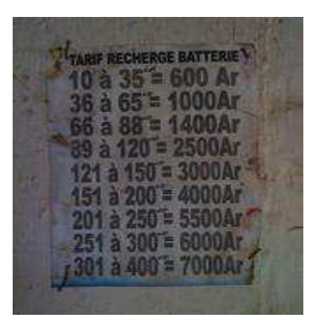
Posting up the different prices of recharges according to the battery size