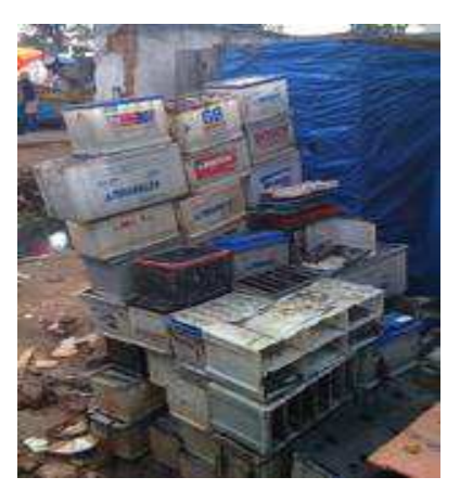
The commercial entrance to a workshop : the used batteries serve to advertise the business