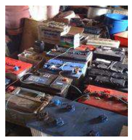
Batteries continuously connected for recharging

Document 1: The exchange facilities in the second-hand battery market