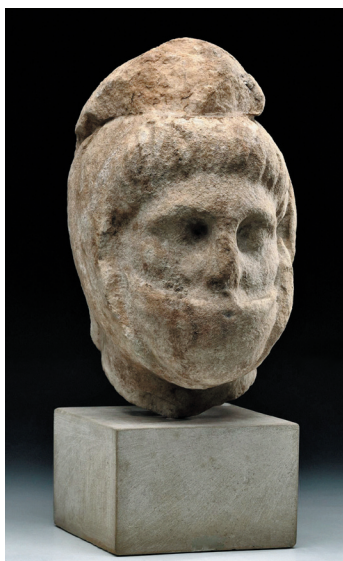
Fig. 9 : Head of a Persian wearing the Kyrbasia headdress. From the Maussolleion. Life size. London, British Museum (Photo British Museum Image Service AN39982).