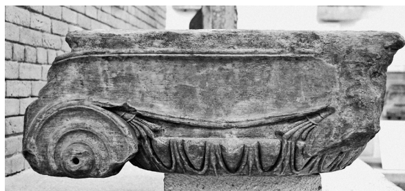
Fig. 12 : Ionic capital from the Temple of Athena Nike on the Akropolis, Athens. London, British Museum.

refer to the Erechtheion's frieze where white marble figures were attached to a dark blue limestone background 35 .