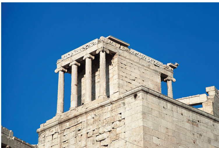
Fig. 7 : Athens, Akropolis, Temple of Athena and Nike Bastion from southwest.

monument show inspiration from more than one source, in more than one geographical and political area. Ann-Marie Carstens' paper in this volume traces the political iconography in the architectural and sculptural themes of Mausollos's tomb to well-known buildings of the Persian empire. In this paper I attempt to trace the religious iconography of the Mausolleion to Athens' best known buildings, the 5 th century temples and shrines of the Periklean building program on the Athenian Akropolis. The Mausolleion stood in between the two very different centers of Mediterranean culture. In his use of motifs from both Persia and Athens Mausollos constructed a monument that not only reflected his own cosmopolitan background but broadcast his political and religious ambitions.