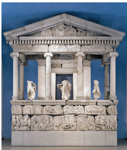
Fig. 6 : Nereid Monument from Xanthos. Reconstruction in London, British Museum (Photo British Museum Image Service AN258120).