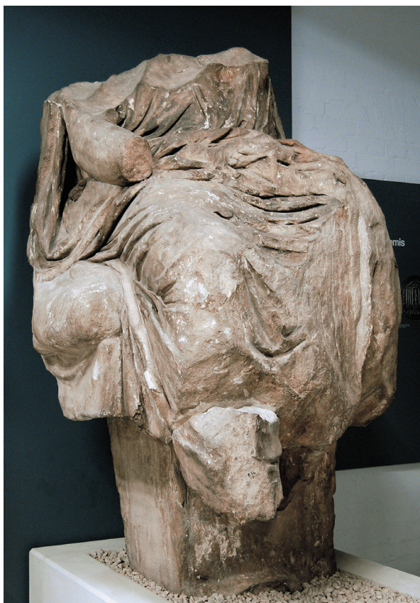
Fig. 10 : Colossal seated male, possibly Maussollos. London, British Museum.

the lower podium's lowest section. The figures moved towards the East where a colossal seated figure, most likely Maussollos, waited to receive their offerings before a doorway at the center of the East side (fig. 10). Over-life-size sculptures of