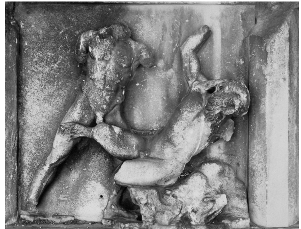
Fig. 18 : Theseus wrestles Skiron. Metope from the North frieze of the Doric temple often called the Hephaisteion. Agora, Athens.

The sculptural connection with Athens may have been recognized in antiquity. Between the two of them Pliny and Vitruvius name five sculptors