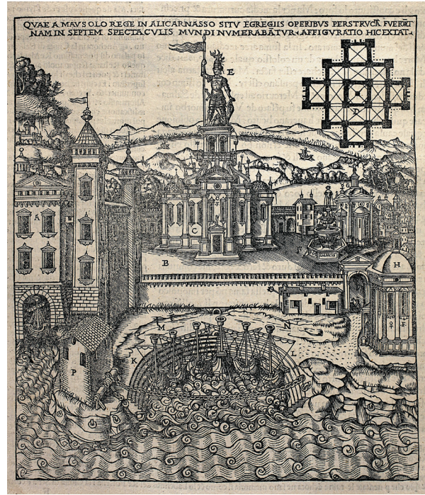
Fig. 1: Cesare Cesariano, The Mausoleum of Halicarnassus, woodcut (from Di Lucio Vitruvio Pollione, De Architecture libri decii [Como: Gotardus 1521] Book 2, Ch. 8.1, 13-15.).

The Maussoleion at Halikarnassos was arguably the most famous intramural burial of classical antiquity. By the 2 nd century BC the “ mnema of Maussollos” was listed as one of the Seven Wonders of the ancient world 1 . It may well have stood until the 12 th century of the Common Era. The irony of its final dismantling by the Knights of St. John in the 16 th century in order that they might rebuild the castle of St. Peter is heightened by the fact that at the moment the blocks of the Maussoleion were being destroyed in Halikarnassos, the tomb was being visualized by European artists and architects. One such early reconstruction is Cesare Cesariano’s woodcut of the Maussoleion that served as an illustration in an early edition (1521) of Vitruvius’s de Architectura (fig. 1) 2 . Once Renaissance artists rediscovered it in the works of the Roman writers Pliny and Vitruvius, and began their reconstructions on paper, the Maussoleion’s fame was assured for posterity in the western canon 3 .