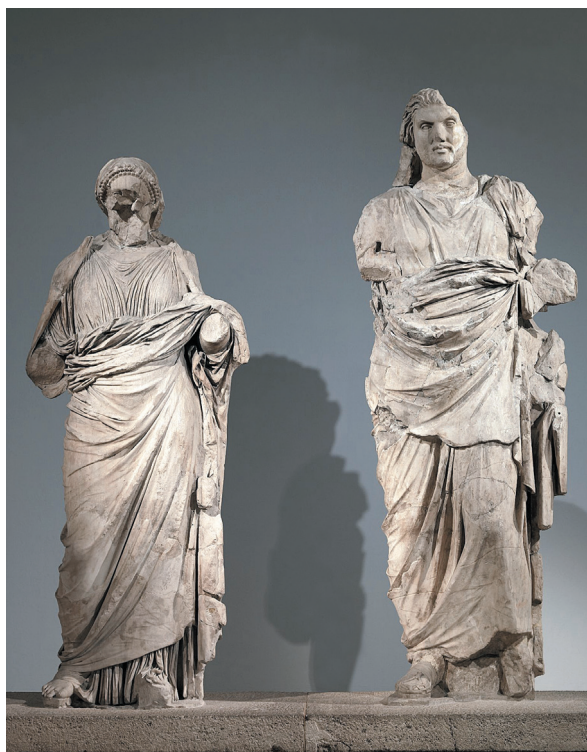
Fig. 14 : Colossal standing draped female with archaizing hairstyle, often identified as Artemisia and colossal standing draped male, often identified as Maussollos. London, British Museum (Photo British Museum Image Service AN103752).

male figure in kingly robes (fig. 14). The archaizing hairstyle of the beautifully draped female figure, often called 'Artemisia', suggests that she represents a family member, lady in waiting or heroine from an earlier time period, a predecessor of the rulers of the middle of the 4 th century BC. Another sculptural fragment preserves only the head of a beautiful, idealized female (fig. 15). Like the 'Artemisia', she wears an archaizing hairstyle where three rows of curls frame the face and forehead while a sakkos conceals the rest of the hair 37 . The white stone statues of sumptuously