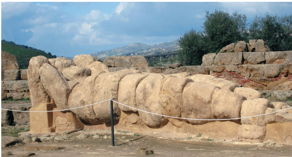
Fig. 4 : Atlas support from the Temple of Zeus Olympios, Akragas (Photo courtesy of B. Dutfield).

in the hero's pose the posture of the colossal Atlas figures from the exterior of their own city's temple of Zeus Olympios (fig. 4). An Athenian visitor to Olympia might imagine Athena resting her bare feet on the rocky surface of the Akropolis on the metope where Herakles brings the goddess the Stymphalian birds (fig. 5) 7 . An athlete from Nemea would acknowledge a story from his region when saw the metope that showed Herakles' first labor, the defeat of the Nemean Lion, and so on. By referring to temples, tales and topography from other regions the building's master sculptor underscored the panhellenic quality of the sanctuary and the games in honor of Zeus at Olympia.