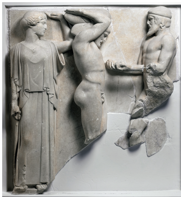
Fig. 3 : Athena, Herakles and Atlas. Metope from the Temple of Zeus at Olympia. 471-457 BC.

subtle, from one context to another 5 . According to Krautheimer a small church in Germany, France, Italy or England could call to mind the Church of the Holy Sepulchre in Jerusalem through the use of the same number of piers or columns even if the later church was built in a completely different style and on a much smaller scale than the original church that inspired its construction, and even if the form of the support – a pier or column – varied from that of the original 6 . More overt patterns of imitation and emulation in architectural style and sculptural subject matter can be seen among buildings in different parts of the Mediterranean as early as the 5 th century BC. One case is found at Olympia where the sculptor of the metopes of the 5 th century temple of Zeus (constructed between 471-457 BC) intentionally made reference to architectural or topographical features of different poleis in Greece and Magna Graecia in certain metopal compositions. On the metope where Atlas brings Herakles the Apples of the Hesperides, the hero holds the heavens apart from Earth with his bent arms, tense body and locked knees (fig. 3). Athletes from Akragas who competed at Olympia would recognize