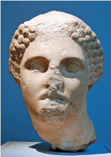
Fig. 15 : Female head with an archaizing hairstyle, from a colossal statue of a woman from the Maussolleion (Waywell 30). London, British Museum.

draped royals between the columns of the peristyle, which stood before a blue stone wall, must have had an immediate visual impact. They have been suggested as the inspiration for the disposition of female figures between columns on the Mourning Women Sarcophagus at Side, and the figures between columns on the Altar of Athena at Priene 38 . Again, they may have drawn inspiration from the white figures against the dark blue-gray Eleusinian stone of the Erechtheion frieze 39 .