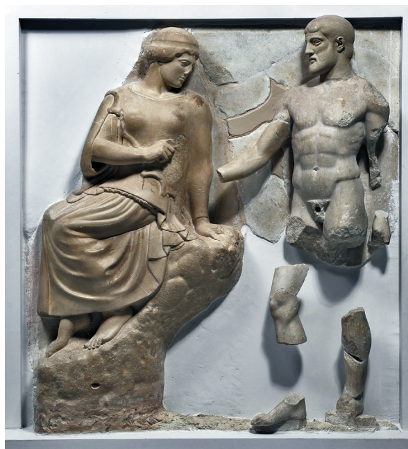
Fig. 5 : Athena, Herakles and the Stymphalian Birds. Metope from the Temple of Zeus at Olympia. 471-457 BC.

form of the Ionic temple on top of a high podium (fig. 7) 9 . While the design of the Maussoleion of Halikarnassos has many stunningly novel features, others seem recognizably and intentionally derivative. The known elements of Mausollos's