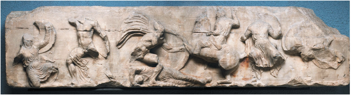
Fig. 17 : Slab from the south frieze of the Temple of Athena Nike on the Akropolis, Athens. Battle between Persians and Greeks. London, British Museum (Photo British Museum Image Service AN11441401).

culture hero revered in many cities throughout the Greek world. Theseus, however, was the mythological ancestor of the Athenians credited with the synoikism of Attica and the foundation of the democracy. As such he is credited with having founded the New Athens of the late 6 th century, which flowered during the 5 th century BC. It has been suggested that the reference to Theseus would highlight Maussollos's role as synoikist of the Halikarnassos peninsula, and his role as the new founding hero of the city of Halikarnassos 46 . The two figure scenes on the coffers are not unlike those of the deeds of Herakles and Theseus found on the metopes of the so-called Hephaisteion, the later 5 th century Doric temple in the Agora of Athens (fig. 18). The struggle between Theseus and Skiron is one such composition that finds a parallel on the Mausolleion (Fig 19). Among the roster of the early founders of Halikarnassos enumerated in the Salmakis inscription is Anthes, a son of Poseidon, who settled in Karia with colonists from Troezen, the birthplace of Theseus (also a son of Poseidon) 47 . The Anthes-Troezen association would tighten further the connection between Maussollos and Theseus, the Athenian synoikist 48 .