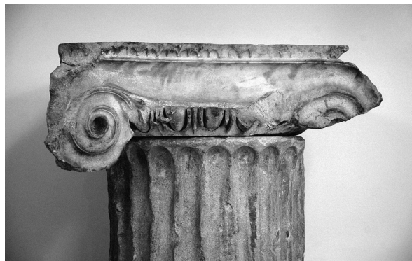
Fig. 11 : Ionic capital from the Maussolleion. London, British Museum.