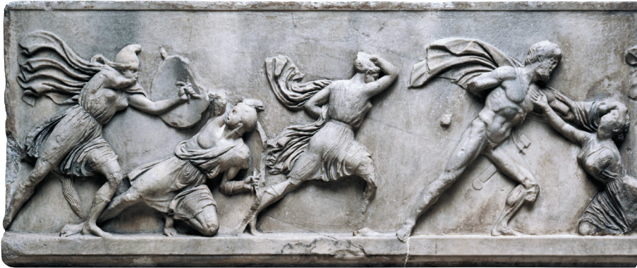
Fig. 8 : Slab from the Amazonomachy frieze from the Mausoleion. London, British Museum.

a religious, sympotic or even funerary function 18 . Maussollos's choice of a highly visible site on a hillside had an immediate precedent in nearby Lykia with the so-called Nereid Monument of Kheriga or his successor, Arbinas, which dates to about 370 BC. That monument is sited just outside the city gates. The heroon of Perikles at Limyra also occupied a prominent position on the slope of an acropolis, in this case looking down on the city and plain below 19 . The Maussoleion likewise dominates the city of Halikarnassos, but from within the city limits. Its sheer size suggests that its architects may have wished on one level to emulate a "far-shining monument" such as the sema of Achilles, described in Homer's Odyssey , Book 24, which Agamemnon says was built on a tall headland in order to be telephanes , "far-shining": "to be seen today by men far out on the sea, and those of future generations" 20 . The Maussoleion had heroic connotations through scale and siting. It also faced west, as was the case for many ancient heroa 21 . The architectural and sculptural programs of the Maussoleion, however, carry an iconographical implication beyond that of a Homeric-style or heroic monument.