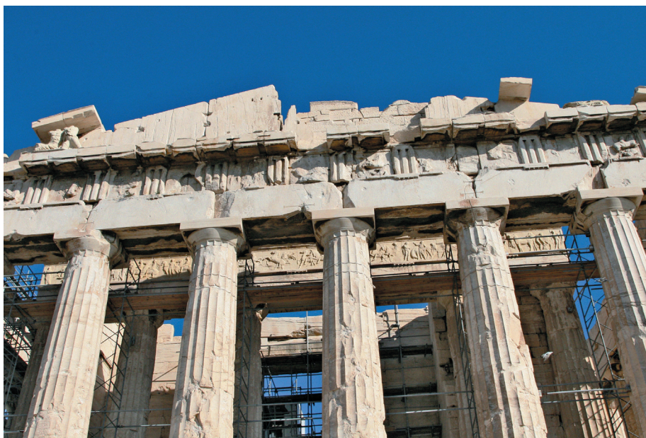
Fig. 16 : West façade of the Parthenon, Athens, with a view of the figures on the west frieze between the columns of the peristyle.

involved in the foundation of the city and deities worshipped in the city, founding heroes and early kings, ancestors of the Athenians and present day (i.e. mid-5 th century BC) Athenians are all present on the Parthenon's two dimensional frieze. The figures are viewed from below, and are seen between the columns of the outer peristyle. At Halikarnassos the figures are fully three-dimensional and on a colossal scale, yet the message seems similar. On both the Parthenon and the Maussoleion the combination of divinities, founders, forebears, ancestors and present day citizens are seen between the columns of each building's peristyle 45 .