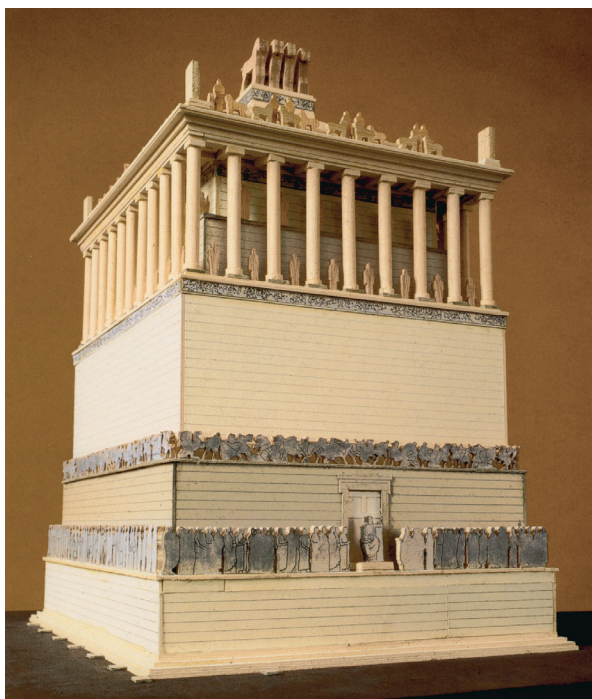
Fig. 2 : Model of the Mausoleion of Halikarnassos as reconstructed by K. Jeppesen (Photo after Jeppesen 2002, frontispiece).

architectural forms and styles, but instead present a unique, positive solution to the unusual problem of how to incorporate a massive burial monument within the walls of the redesigned city of Halikarnassos. When we consider the architectural features of Mausollos's tomb and heroon in concert with the sculptural program, we find a carefully constructed series of references to well-known religious buildings from the major cultural center of the Mediterranean in the Classical Period, Athens. A study of the iconography of the architecture and ornament of the Mausoleion helps us understand the placement of the tomb within the city center. It also helps situate Mausollos vis à vis Halikarnassos and Halikarnassos in the Mediterranean, and further reveals the refounder's ambition for the new Karian capital.