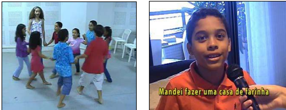
FIGURE 3. A screen shot from an audiovisual example of Brazilian children singing (left panel) and an individual child modeling the pronunciation of the first line of the song [with kind permission of Alda de Jesus Oliveira, from the Quadcultural Songbook study under direction of Lily Chen-Hafteck].

The particular page of metadata can be accessed from several routes. For example, a search on “Brazil” and “folk song” would lead to this collection “Quad-Country Teaching Packet Videos – Brazil”. Figure 3 shows a screen shot from each of the last two video files ( br6escravos.wmv and br6escravosp.wmv ) represented in this above example. The left panel shows a screen shot from a video clip of children in Brazil singing the song Casa de Farinha (The Flour House) and on the right, one of the children pronouncing the words (without singing) for the first line “Mandai fazer uma casa de farinha”, providing a model to enable teachers from outside Brazil to teach pupils this song from the Brazilian culture. This video is part of a larger corpus of children’s songs from three other countries (Canada, China, and Kenya) plus Brazil, for a study led by Lily Chen-Hafteck. For each of six songs from each country, a video of the children singing the song is matched by a second video provided by one child modeling the pronunciation of each word of the song. The microphone is visible in this example from Brazil.