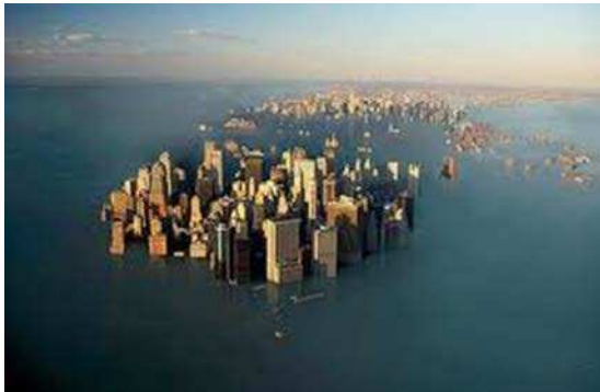
<This is not Tuvalu>

Set aside these contested arguments, or exactly among these very contested disputes, you can easily see in the internet the images such as follows; The image like below with the caption, say, 'This is not Tuvalu,' and, of course, it is not, but (the photo of) New York in a composite picture.