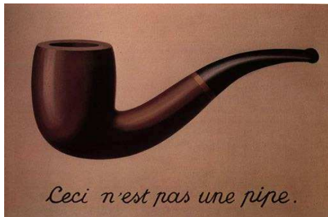
<This is Not a Pipe>

In this direction we start with the argumentation of 'this is not a pipe.' 'This is not a pipe' is a title of Rene Magritte painting as well as that of the article written by Michel Foucault upon the painting.