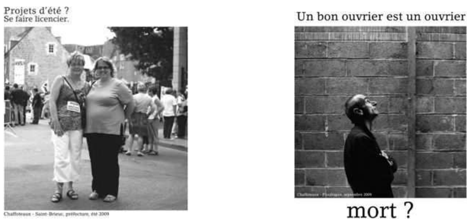
Fig. 6. Pictures of Chaffoteaux conflict

• « Support to Chaffoteaux », or the everyday life of a conflict — On June the 18th, 2009, the French management of Chaffoteaux heralds the closing down of the plant in Saint-Brieuc. 204 employees are threatened. The conflict lasted more than 6 months, and ends with the signing of an agreement including an extra-conventional severance pay worth 25000 Euros for each worker, specific pre-retirement measures and a job center. Shortly after the beginning of the conflict, a representative from the local cultural authority, gets in touch with union representatives and suggests to hire a photographer to document the conflict and its daily round of activities. François Daniel, the photographer, sets in the plant and takes some pictures. As he puts it, « the first idea was to describe what was happening in order to witness; to portray these lived experiences ». At night, he prints his photographs and displays them in the hall of the trade unions the next day. He also posts the pictures to a blog in a chronological way. And he decides to print some postcards, entitled « Any summer project? Getting laid off » and « Any project after holidays? Getting laid-off », that have been sent across Europe.