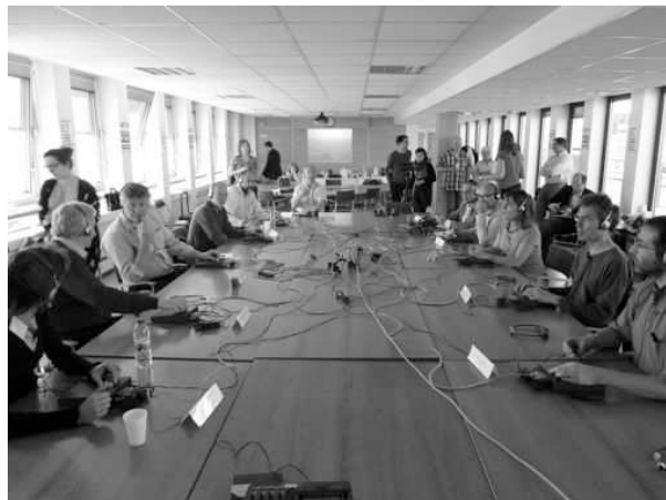
Fig. 2. The conversational simulation table

Over time, a third objective was gradually formalized. We moved one step further by designing conversational devices that involved and engaged participants more strongly. We sought for more active participation of group members in order to give rise to exchange emerging from the collective work. During the second seminar, the “conversational simulation table” was introduced and used in an afternoon session. The device enables group discussion based on the principle: one can choose whom to listen to, one cannot choose whom to address.