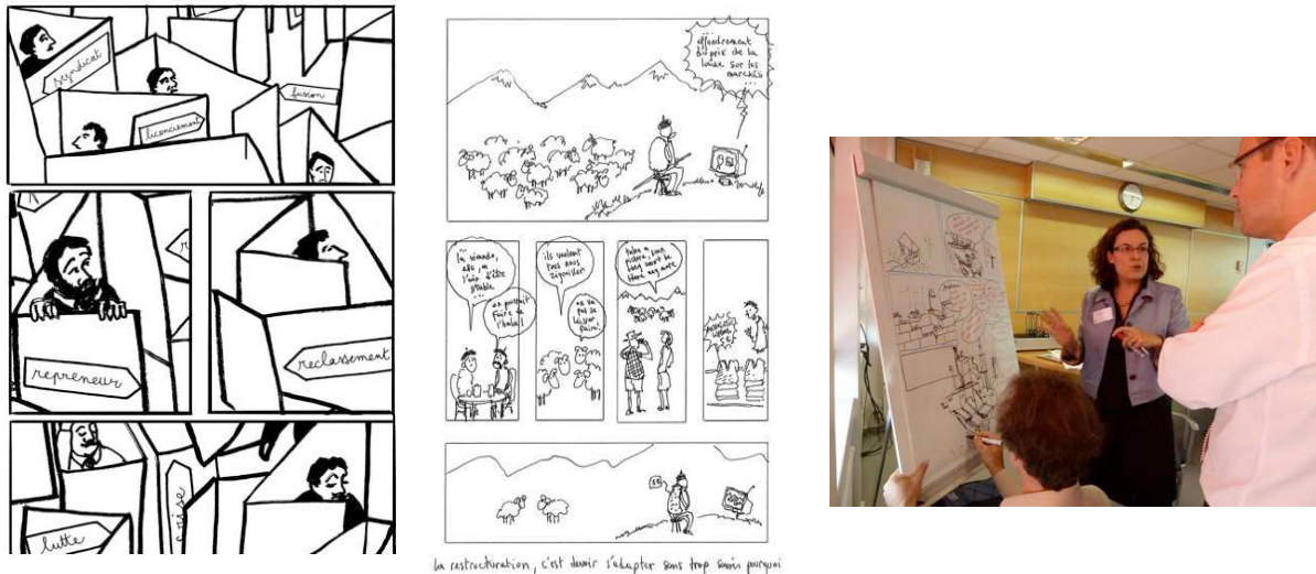
Fig. 3. Two comics realized by the participants (the first redesigned by young illustrators) and a picture the comic strip workshop (seminar 4)

The fourth seminar was an opportunity to propose a workshop about "comic strip" in which participants were invited to speak metaphorically as individual and as a group around their representation of restructuring by completing and illustrating the words: "Restructuring is like...".