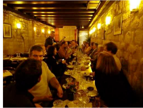
Fig. 5. Seminar 4 in Paris... gradually building a community

These three limitations to easy and constructive conversation were gradually avoided. Progressively transformed by the words and gazes of others, stimulated by more and more involving conversational devices, we observed in the next seminars a growing ability of the team members to interact around the artworks on a unified basis. This evolution translated into the progressive development of a common language, both on restructuring and art, into the setting up of a shared way of approaching artworks (openness to its ambiguous, plural and sometimes paradoxical meanings, detachment of the sole question of their “realism”, growing attention to esthetic questions), into more and more intertextuality (references to other artworks previously presented) within debates, etc. Finally, if interpretations were varied and sometimes even conflicting, the multiple interpretative communities facing difficulties to talk to each other gave birth to a (more or less) unified single interpretative community of inquirers able to grasp a same object with a same approach and create meanings out of their differences.