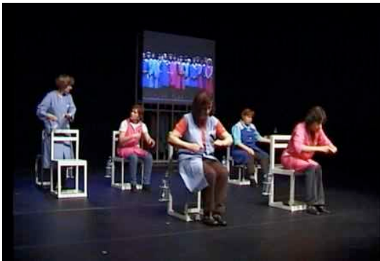
Fig. 8. Body and gestures rhythms at work in the play “501 Blues”

Hence the physical violence of the layoff and of the plant closure which is a radical change in life rhythms.