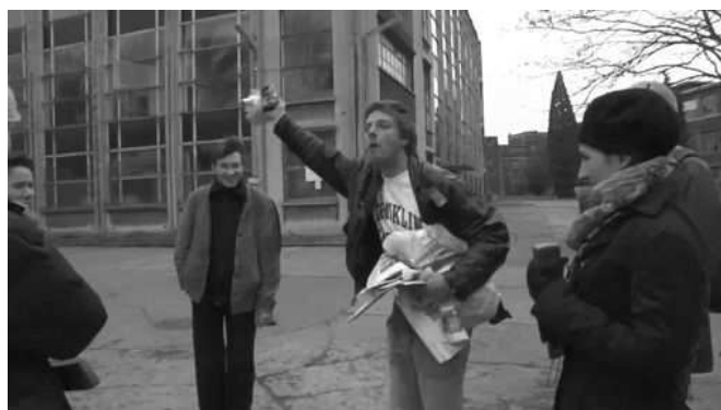
Fig. 4. Seminar 5 in Liège: an actor, playing the role of a homeless, is hailing the group

Another example is the fifth seminar in Liège, which was designed specifically around this type of engaging conversational devices putting participants in the role of “actors in a situation”. These opportunities for collective production (experiencing a virtual restructuring, a photo album....) or experimenting situations such as the hailing of the group by a homeless man who turned out to be an actor during the visit of Liège, engaged participants through provocation, and helped to stimulate the discussion and the exchanges focusing on a shared experience.