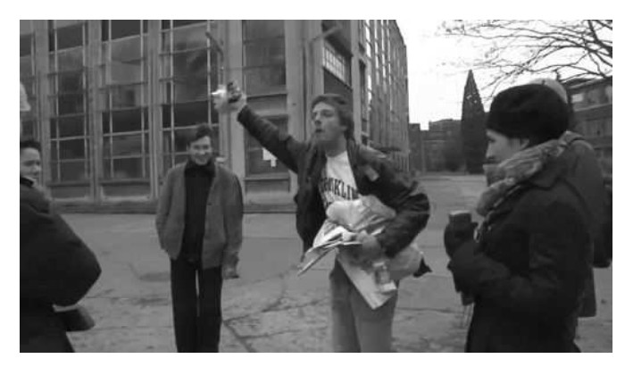
Fig. 4. Seminar 5 in Liège: an actor, playing the role of a homeless, is hailing the group

Another example is the fifth seminar in Liège, which was designed specifically around this type of engaging conversational devices putting participants in the role of "actors in a situation". These opportunities for collective production (experiencing a virtual restructuring, a photo album....) or experimenting situations such as the hailing of the group by a homeless man who turned out to be an actor during the visit of Liège, engaged participants through provocation, and helped to stimulate the discussion and the exchanges focusing on a shared experience.