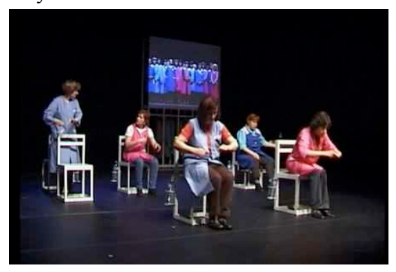
Fig. 8. Body and gestures rhythms at work in the play "501 Blues"

Hence the physical violence of the layoff and of the plant closure which is a radical change in life rhythms.