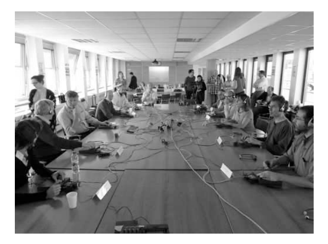
Fig. 2. The conversational simulation table

Over time, a third objective was gradually formalized. We moved one step further by designing conversational devices that involved and engaged participants more strongly. We sought for more active participation of group members in order to give rise to exchange emerging from the collective work. During the second seminar, the "conversational simulation table" was introduced and used in an afternoon session. The device enables group discussion based on the principle: one can choose whom to listen to, one cannot choose whom to address.