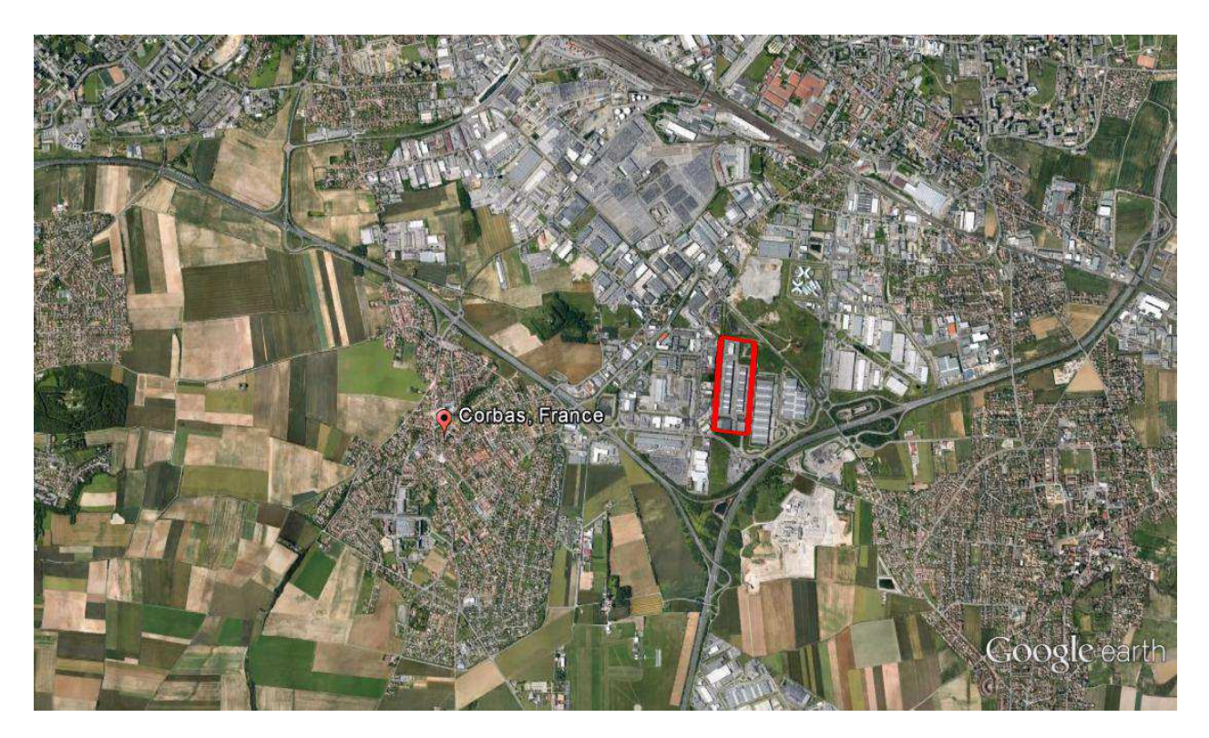
Figure 3 : the new « Marché d'Interêt National » in Corbas

By studying the evolution of the Confluence between 1999 and 2012 we can notice that the economic structure of the Confluence area profoundly changed during this period. As the MIN occupied a large portion of the neighborhood, the implantation of other types of activities was limited to the northern part of the area. Starting from the reorganization of the area the southern part of the Confluence was opened to residential infrastructures and shops (a shopping mall was also opened), thus increasing the global number of establishments (mainly small shops, services and offices) from approximately 990 to 1570 establishments. We can in fact notice that the structure of the area, evolved from a particular form of wholesale area to a regular urban framework. The next figures were produced thanks to the Freturb model and the SIRENE<sup>1</sup> file produced by the INSEE<sup>2</sup>.