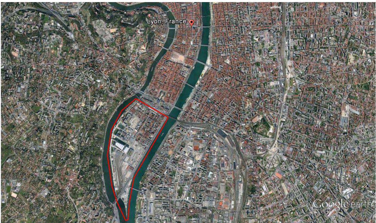
Figure 1 : la « Confluence » area in Lyon (within the red perimeter)

By building several scenarios in terms of urban planning, the target is to understand the mechanisms and impacts of heavy urban projects on goods movements and implementing solutions linked to regulation, land-use and logistics including distribution centers, parking lots.... By applying a systemic view of the subject, this work will also take into account the major constraints of the urban system (Ambrosini and Routhier, 2004). This paper will include the comparison between the present situation of the chosen example (i.e. "La Confluence") and the scenarios build through the previous steps of this method.