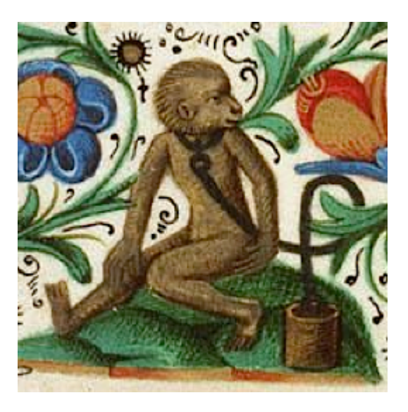
Den Haag, Koniklijke Bibliotek, Ms. 135 K40, f. 14, 15th century

The 13<sup>th</sup> Century encyclopaedist Bartholomew of England says that the ape, which is a fierce and malicious beast, may be tamed thoroughly by violence using whips and chains. He adds that wooden blocks ( trunco sive blocco ) are attached to monkeys to prevent them from going anywhere they want to and to suppress their insolence ( De