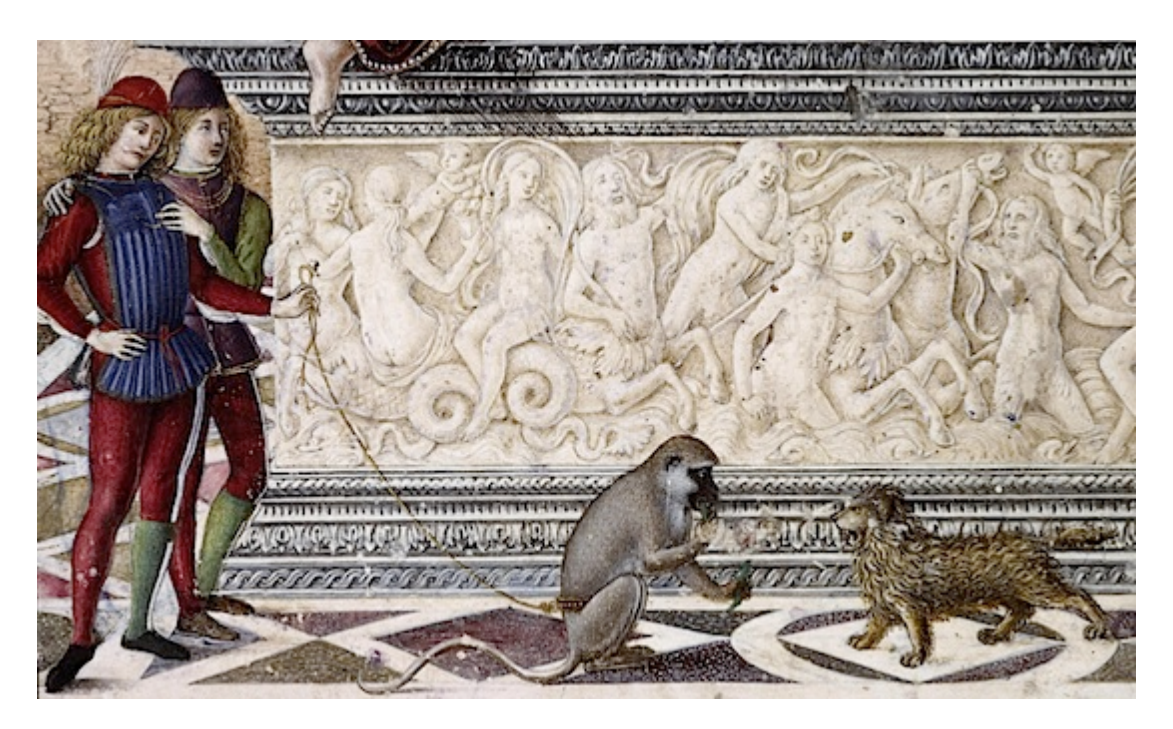
Detail of a miniature by Attavente. Missale, end of 15th Century, Lyon, Bibliothèque municipale, Ms. 512, f.

They were different types of hand-leashes, which can sometimes be used to attach the animal to a wall as in the famous image by Durer of the Virgin with a monkey. Leashes were attached to a collar fasten around the neck or directly to the neck or belly.