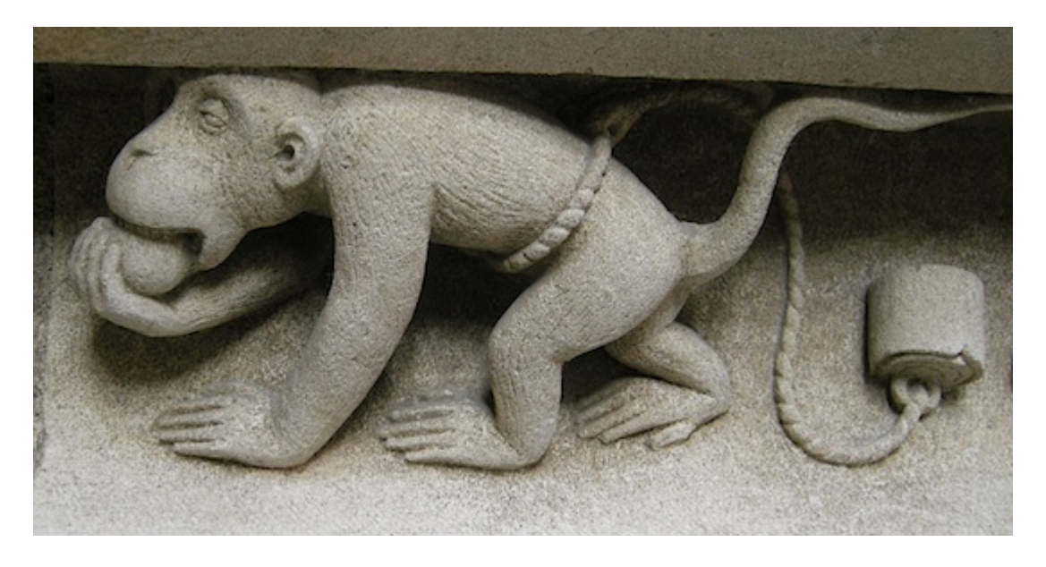
Palais Jacques-Cœur, Bourges, 15th-16th Century.

In the Palace of Jacques-Cœur, in the city of Bourges, capital of the Dukes of Berry at the end of the Middle Ages, one can find a curious monkey ballet sculpted in the stone of a chimney and dating to the end of the 15th and the beginning of the 16<sup>th</sup> century. Monkeys are attached to wooden blocks by ropes.