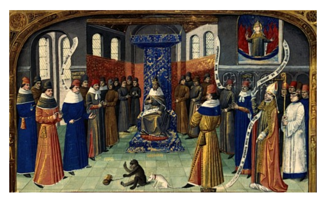
Mâcon, Bibliothèque municipale, Ms 1, f. 211, 15th Century

hauz homes font chiertez") even though this animal is unpleasant and ugly. Alexander Neckam, at he beginning of the 13<sup>th</sup> Century, writes that one could find domestic apes at the court of the rich ( De naturis rerum , 208, cap. 128).